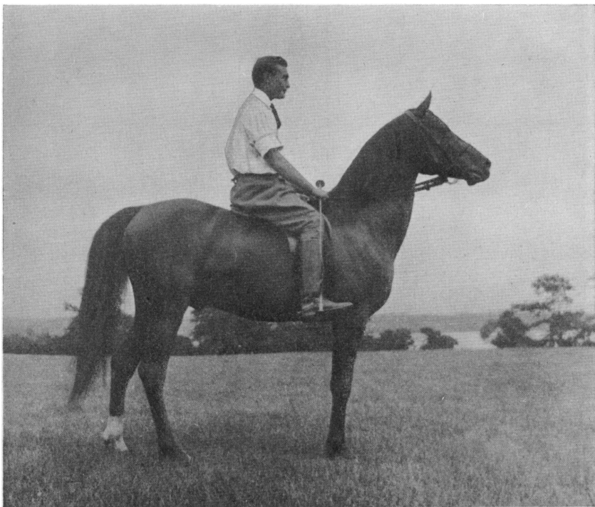
Fig. 2. 'Nimr'.

The American Museum of Natural History has acquired the skeleton of 'Nimr,' a gift from Mr. Randolph Huntington of Oyster Bay, L. I. (February, 1904). This animal was sired by the desert bred 'Kismet,' a famous race horse, and it has a very direct pedigree and history. It is probably as pure an example as can be found of the modern Arab, somewhat enlarged and modified by favorable western environment and abundant food. It has been mounted with consummate skill by Mr. S. H. Chubb for the Museum collection showing the evolution of the horse. The following