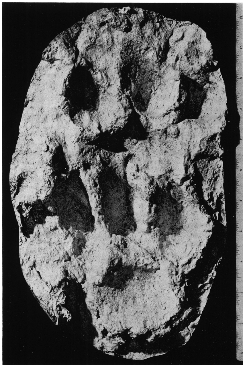
Fig. 2 Plaster replica of the jaguar footprints, made by filling them with plaster and reversing.