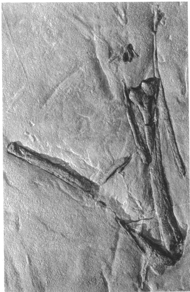
FIG. 1. Coelophthysis sp. (A.M.N.H. No. 7636), a cast. Right pubis (large, horizontally placed bone), right tibia (long, oblique bone), and portions of several ribs. Note break in pubis, near proximal end. Portion of bone below this break is twisted in relation to small, proximal portion of bone. Note also gap in tibia between proximal and distal portions. One-third natural size.