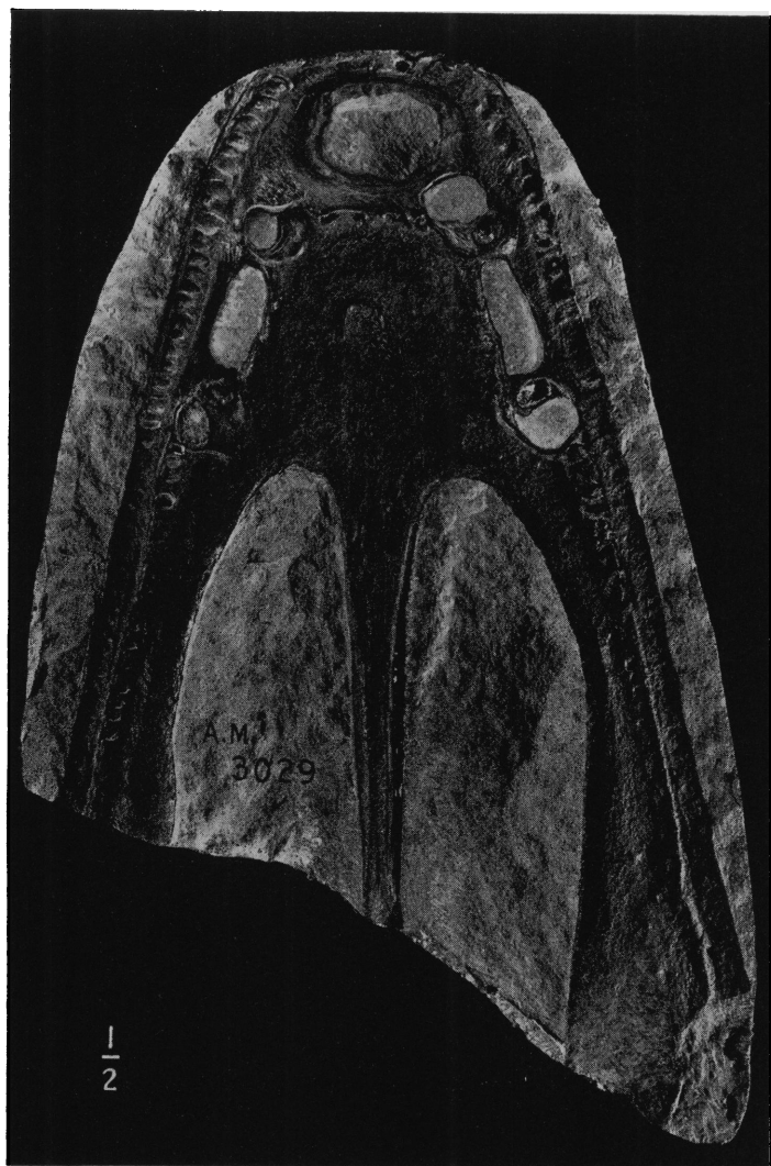
Fig. 2.— Stanocephalosaurus birdi (A. M. N. H. No. 3029). Cast of palate taken from natural impression. One-half natural size.