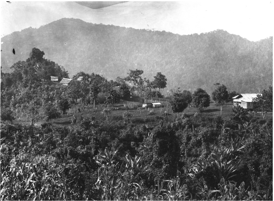
FIGURE 5. View of the mission at Keku.