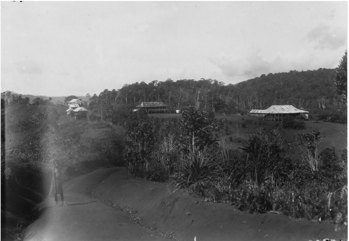
FIGURE 8. View of the surroundings at Wareo (AMNH negative no. 115801).

zigzagged up the sides of ridges to tracks across the narrow tops, with spectacular views of gardens on the steep hillsides. They arrived at Sevia, about 5000 ft, at 1 pm, just in time for the almost daily bank of fog to arrive (fig. 11). On one sunny afternoon, Beck followed a local trail to an elevation of 7500 ft. The summit of this ridge apparently marked the height of land in this part of the Cromwells, for the trail led downward to a village on the other side of the mountains. From these higher altitudes on sunny days the mountains of New Britain could be seen to the east.