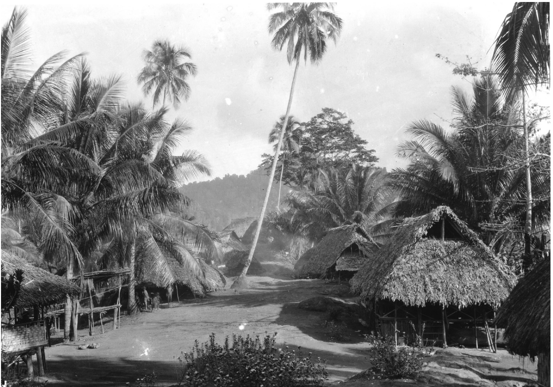
FIGURE 3. "Main Street" in Meganum (AMNH negative no. 115630).

Despite the difficulties of collecting, Beck noted having collected about 320 birds in his six weeks at Meganum. This would have included specimens that Manube (fig. 4), his hired local collector, brought to him from 10 miles farther inland. As Beck described it, Manube left on one day, spent the next day collecting, and returned on the third day. The birds brought in by Manube probably were collected in the Adelbert Mountains, an area the missions considered extremely dangerous at that time but that would have been freely accessible to local people. Manube continued to send Beck birds until 14 September, when Manube accompanied Ida to Madang. Beck continued collecting at Meganum for some time after that, at least until 4 October, and other local men continued to bring Beck specimens on instructions from Manube, who quite possibly had also returned to Meganum from Madang.