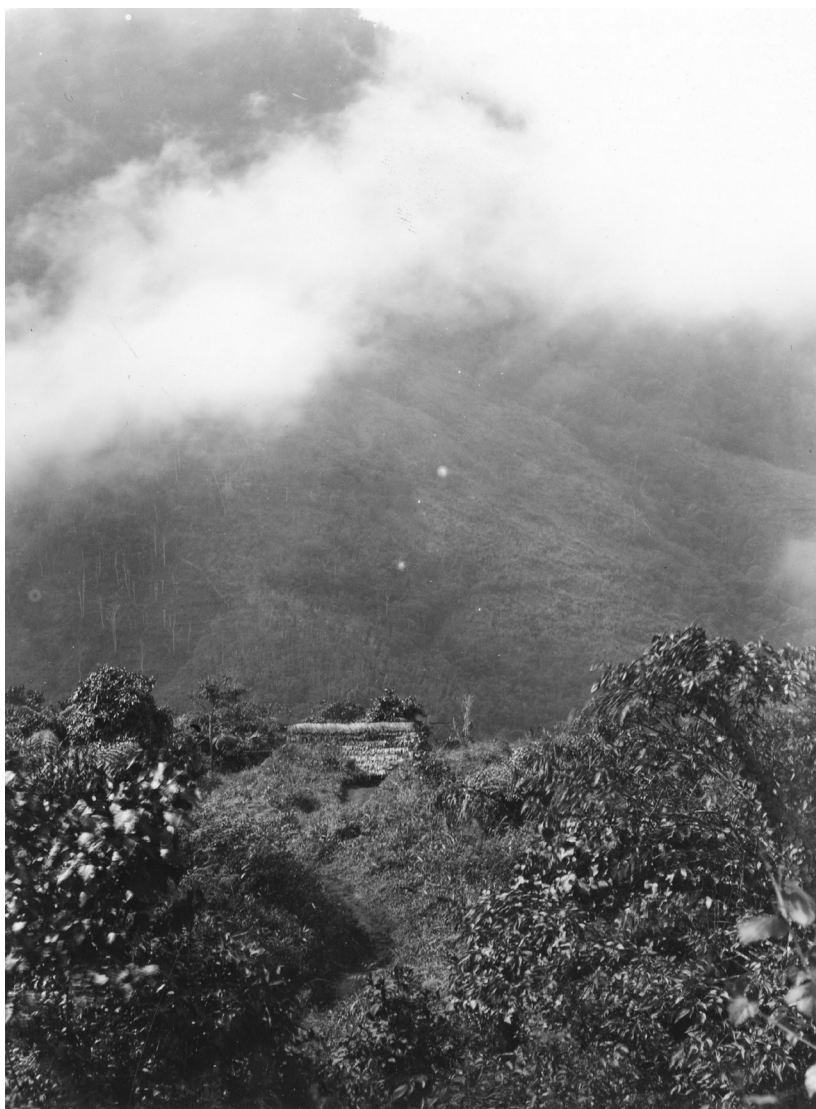
FIGURE 11. View of the surroundings at Sevia (AMNH negative no. 115741).