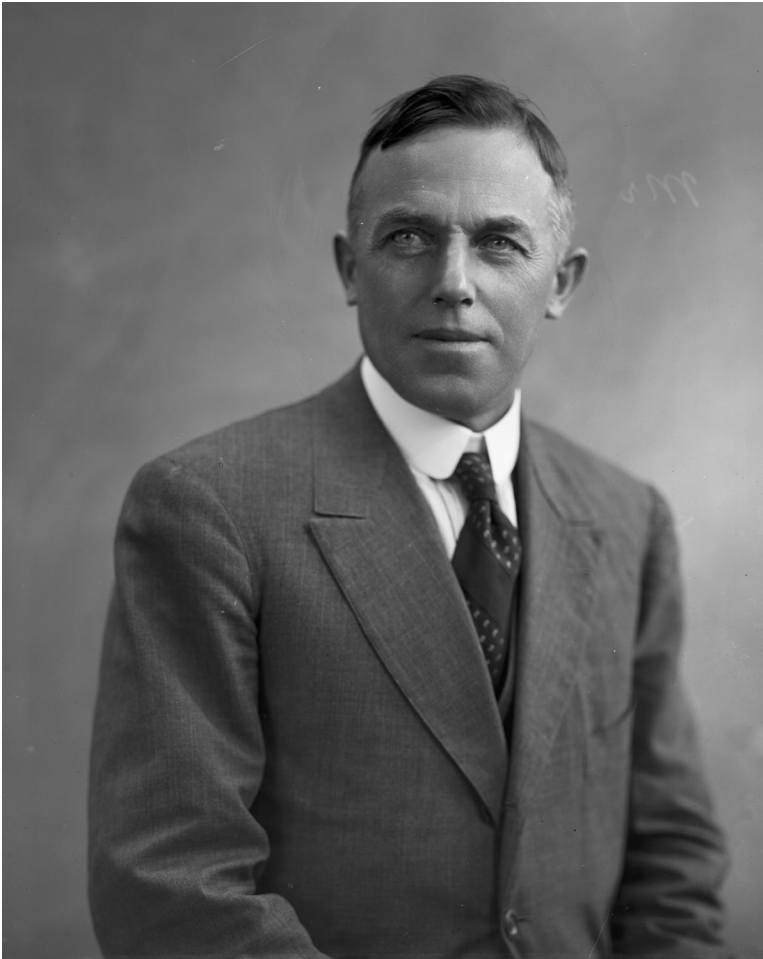
FIGURE 1. Rollo Howard Beck (1870–1950). Photograph made in 1917, at the end of the AMNH Brewster – Sanford Expedition (AMNH neg. no. 36747).

Guinea Birds (Mayr, 1941), Mayr was misled in some cases by these ambiguities in the localities of Beck's specimens.