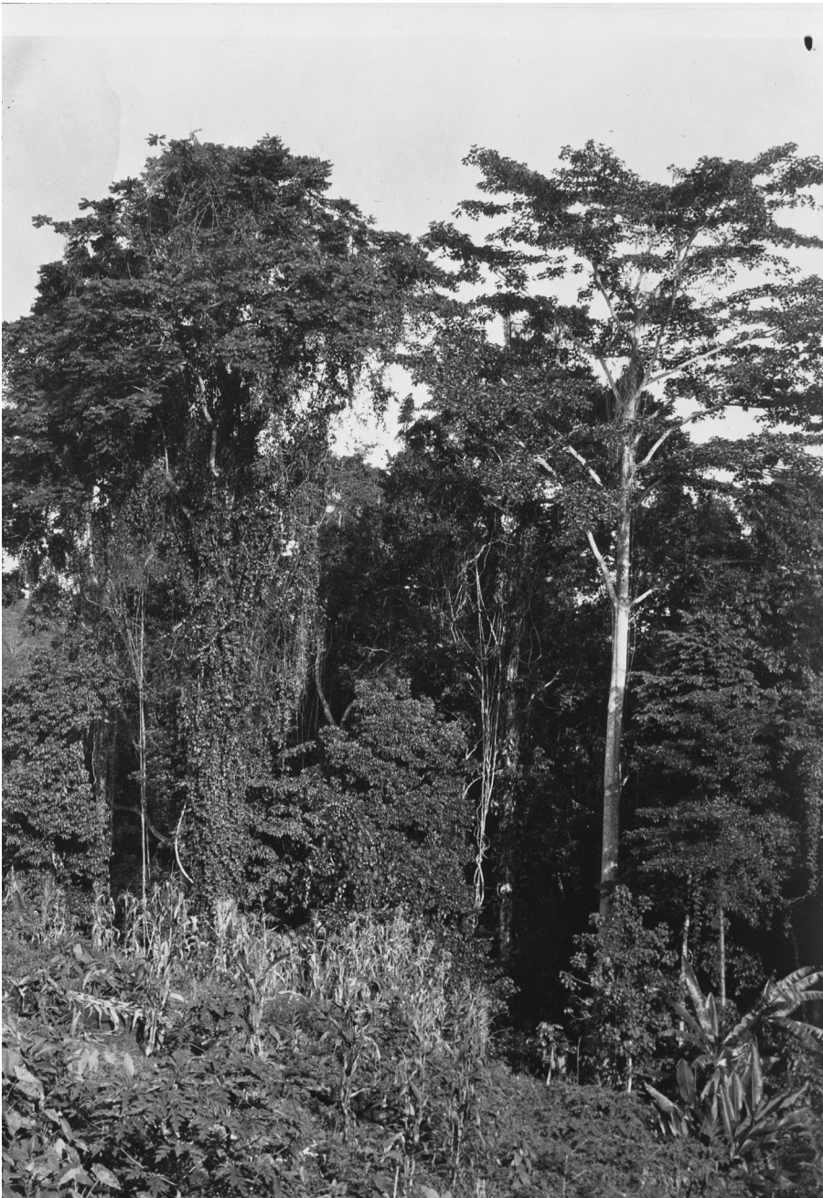
FIGURE 6. Edge of forest at Keku (AMNH negative no. 115594).