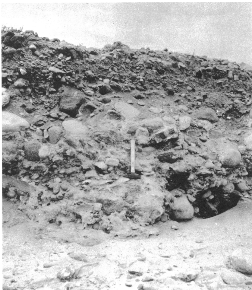
FIG. 2. Exposure of fossiliferous sediments of late Pleistocene age and alluvial cover in the present sea cliff at Bahía Santa Rosalía (collecting station no. 1).

the present beach cliff. Some of the faunal constituents undoubtedly were transported shoreward by wave action and currents from shallow infratidal habitats in deeper water off shore. Deposition on a Pleistocene coast with a topography essentially the same as the present one is suggested by the available faunistic and physiographic data.