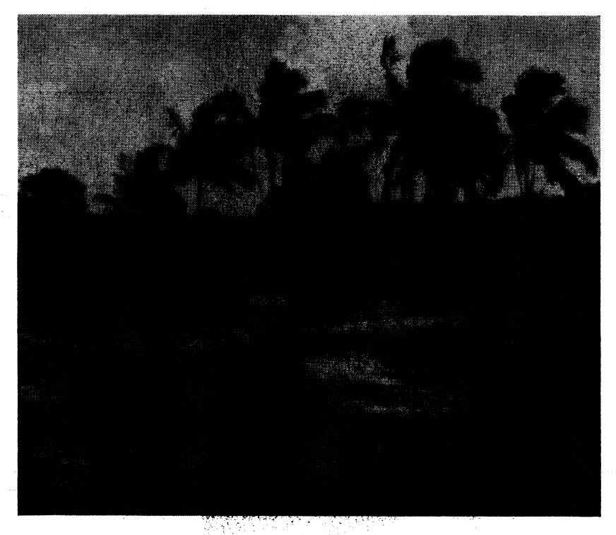
FIG. 6. Western edge of Cavelle Pond; mangrove and incipient blackland.

From Rolle's place we usually continued southward on the beach path (fig. 8) through the coastal rock community, making short excursions into the thorny shrub vegetation of palms, palmettos, and underbrush where openings of a sort had been