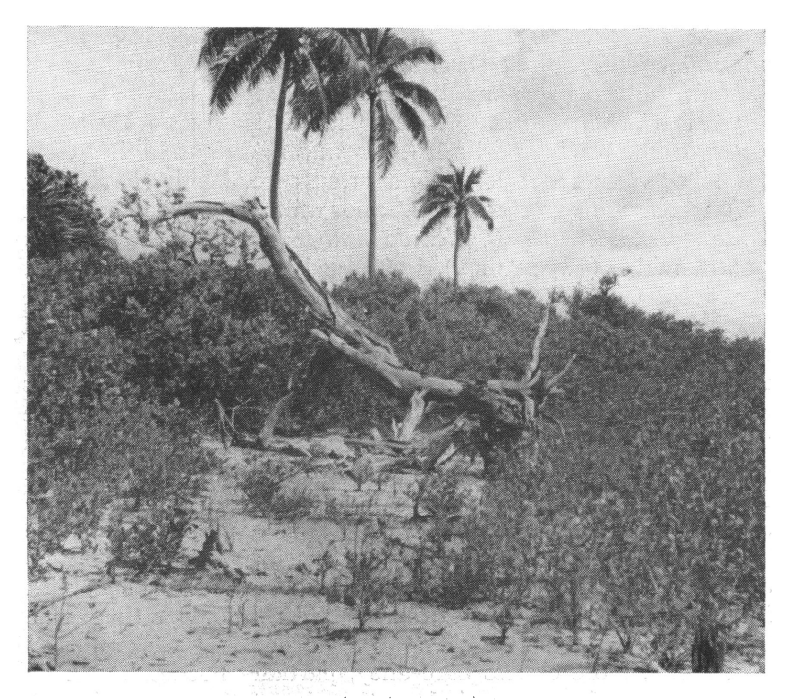
FIG. 4. Western edge of Cavelle Pond; young black mangrove (Avicennia) at right; white mangrove (Laguncularia) and button wood (Conocarpus) at left.

bushes and inhabited, in addition to buprestids, by tiger beetles, flies, and wasps. According to Howard (1950, p. 333) this western margin along Cavelle Pond is being invaded by some of the black land plants from the ridge (fig. 6). In a grassy area near by Cazier made an exciting capture of the variegated Acmaeodera marginenotata , a buprestid of which but one specimen had been taken the year before.