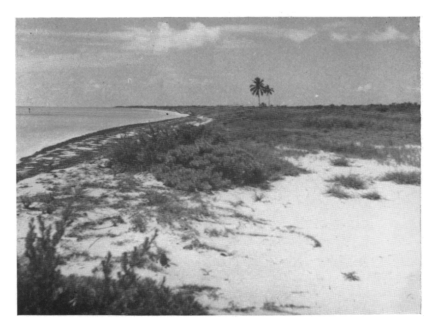
FIG. 2. East Bimini, northwestern end.

The numbers and variety of insects collected on South Bimini would no doubt have been much less had it not been for the work of a Mr. Rolle who had partially cleared and burnt an area on which he intended to build a house and raise a few crops and chickens (fig. 3). His land was situated on what is known locally