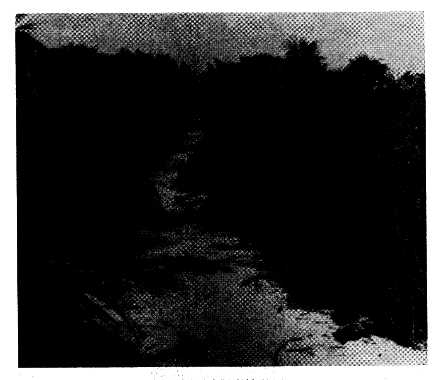
FIG. 8. Beach path looking south. Coastal rock area.

as it flew along a small inland path, Rutela formosa , a beautiful striped cetonid. He also took the second Bimini specimen of Chrysobothris tranquebarica , a buprestid that is widespread throughout the West Indies (Fisher, 1925), but seemingly scarce in the Bahamas. Its food plant is the red mangrove and the Australian pine, both plentiful in the Biminis so that it is strange no more were seen.