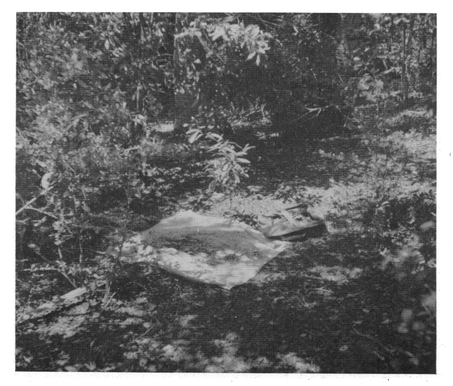
FIG. 7. "Jungle" path behind Rolle's on Sampson's ridge. Sifting for small insects.

Another daytime collecting area on South Bimini was the northeastern shore, but it could be visited at high tide only, as the bay water was too shallow for the outboard motor at other times. Much of this coast is rimmed with mangrove, but a rocky