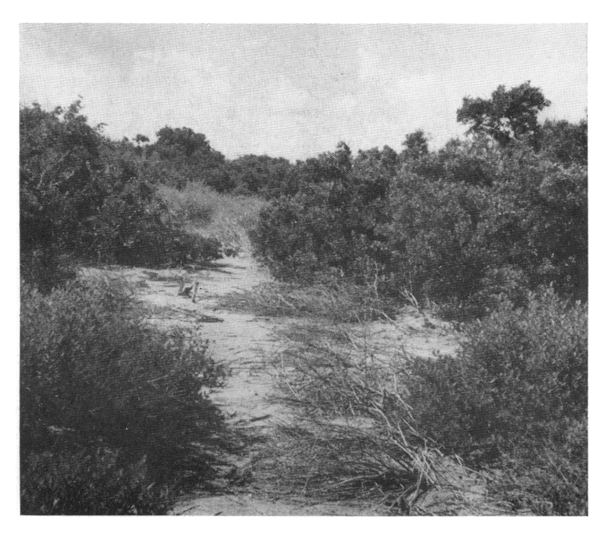
FIG. 5. Western edge of Cavelle Pond, "Paratyndaris Boulevard," with Psiloptera trees (Laguncularia and Conocarpus) in right background.

In what we called the "jungle" behind Rolle's yard is a narrow path along which we swept a series of a small red curculionid of