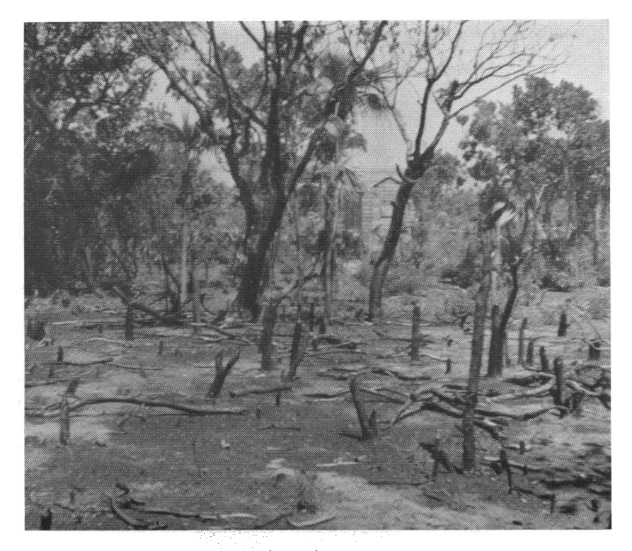
FIG. 3. Rolle's yard on Sampson's ridge; Spondias purpurea in center background.

the middle of May Cazier had found collecting excellent, especially at night. Additional chopping and firing of trees and brush around the yard went on sporadically throughout the summer, resulting in a continual supply of beetles, no matter how often we hunted for them. The rows of burnt stumps, the singed, felled, or broken trees, and the piles of dead limbs and twigs made