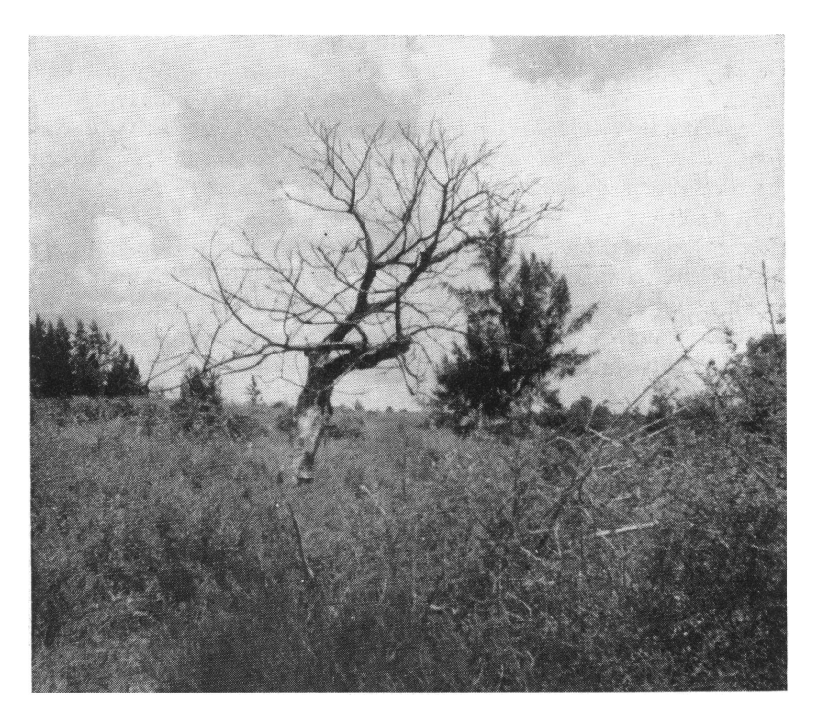
FIG. 9. Dead Spondias purpurea, northwestern South Bimini.

A far greater number of species and individuals, especially of cerambycids, was found at Rolle's burnt-over yard on the ridge which is the place we frequented most often at night.