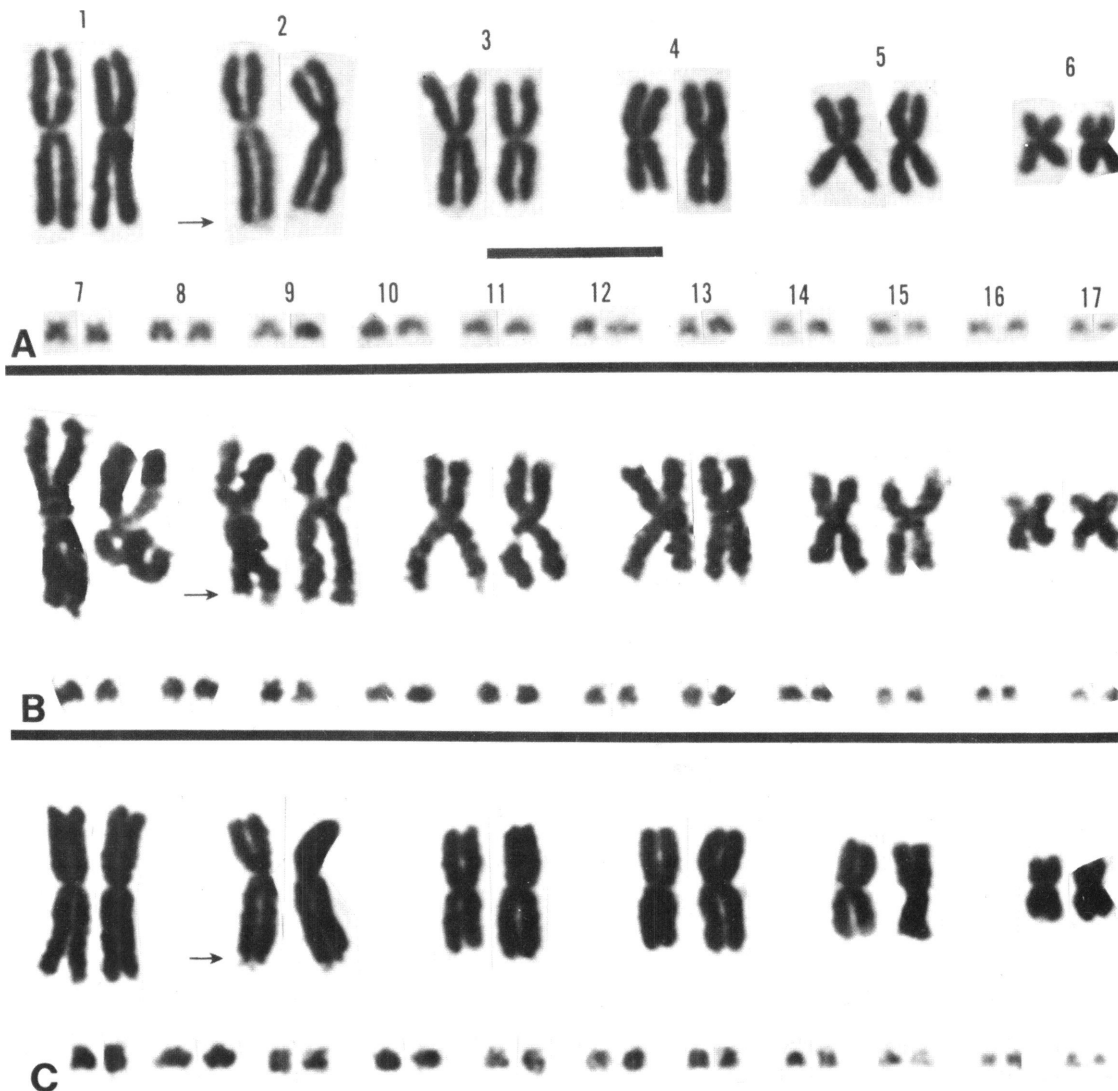
FIG. 3. Karyotypes of species in the jalapae and siniferus groups of Sceloporus . A. S. jalapae ( 2n=34 ), ♂, UAZ 29920; line represents 10 \mu . B. S. ochoteranae ( 2n=34 ), ♂, AMNH 106499. C. S. siniferus ( 2n=34 ), ♀, UAZ 29942. Arrows indicate positions of inconspicuous but characteristic secondary constrictions and satellites.

Examination of 28 cells from seven individuals (three males, four females) reveals a