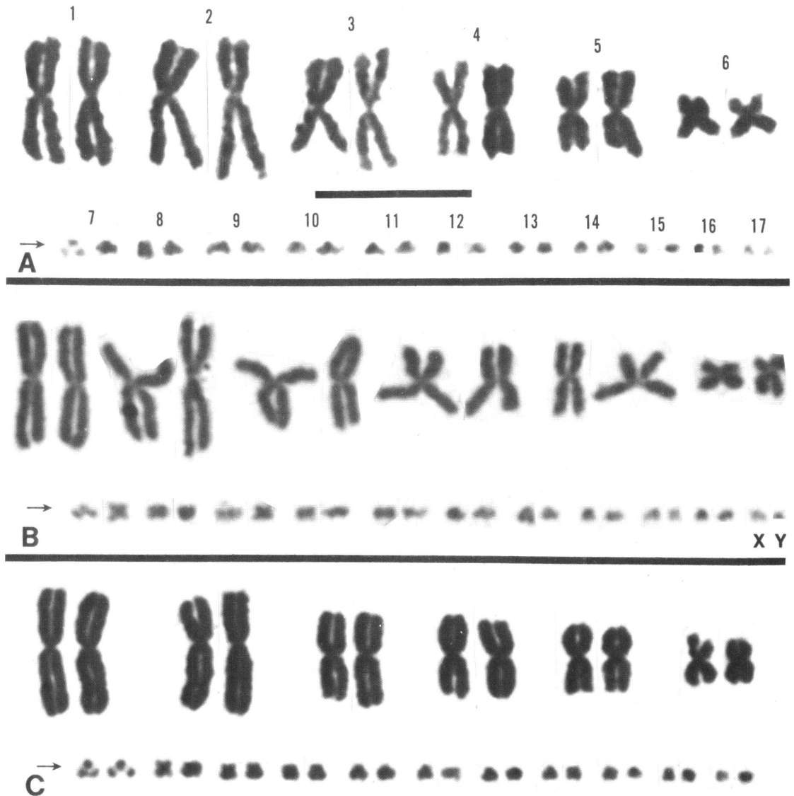
FIG. 1. Karyotypes of two species in the variabilis group of Sceloporus . A. S. variabilis (2n=34), ♀, AMNH 107703; line represents 10 \mu . B. S. variabilis (2n=34), ♂, AMNH 113469; the minute Y is designated and paired with apparently the second smallest microchromosome in the cell, but whether this is the X is unknown. C. S. teapensis (2n=34), ♀, UAZ 29960. Arrows indicate positions of inconspicuous but characteristic secondary constrictions.

Uta by Pennock, Tinkle, and Shaw (1969) and similar to that found in some other species of Sceloporus (Cole, 1971a, b; also see descriptions below; fig. 2C).