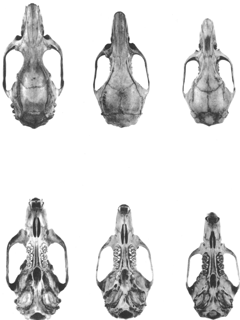
FIG. 1. Dorsal (top) and ventral (bottom) views of crania. Left to right: Lenomys meyeri (A.M.N.H. No. 153011), Boemboelan, northern Celebes; Rattus callitrichus (R.M.N.H. No. 21255), northeastern Celebes; and Eropeplus canus (A.M. N.H. No. 196592), Latimojong Mts., middle Celebes. All are adult males. All natural size.

of the labial and lingual cusps are absent, and those present are joined broadly with the middle series, which produces the laminate appearance. The upper third molar in A.M.N.H. No. 153011 (the cranium illustrated