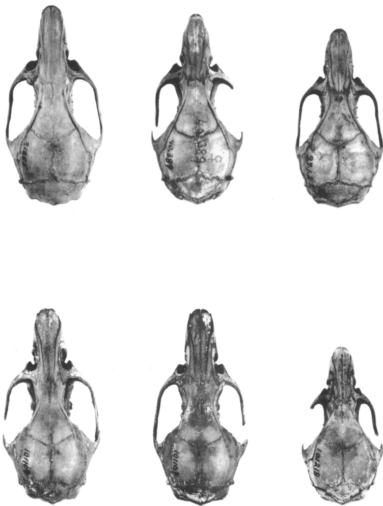
FIG. 2. Dorsal views of crania. Top row, left to right, Rattus c. callitrichus (R.M.N.H. No. 21255), paratype of R. maculipilis jentinki (B.M. No. 40.389), and paratype of R. m. maculipilis (B.M. No. 97.1.2.27). Bottom row, three type-specimens of R. microbullatus . Holotype (A.M.N.H. No. 101108) far left, two paratypes on right (A.M.N.H. Nos. 101109 and 101218, respectively). See table 4 for age and sex of these specimens. All natural size.

alveolar lengths of maxillary tooth rows for five adults of R. taerae range from 9.6 mm. to 9.9 mm.; breadths of the first upper molars vary from