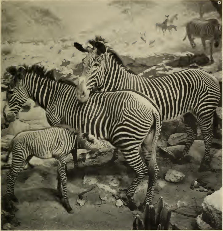
WaterHole group, Hall of African Mammals

floor, in the center, is a herd of seven African elephants, and along the walls are groups of antelopes, giraffes, buffalo, lions, okapis, bongos, and gorillas, in natural settings in the Congo, Kenya, Libya, Tanganyika, the Upper Nile Valley, South Africa, and Ethiopia. At the east end of the hall are two sculptured figures of African tribesmen by Malvina Hoffman; at the west end is a pair of huge elephant tusks.