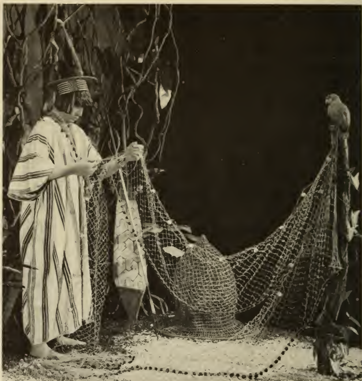
Fishing scene, Hall of Men of the Montaña