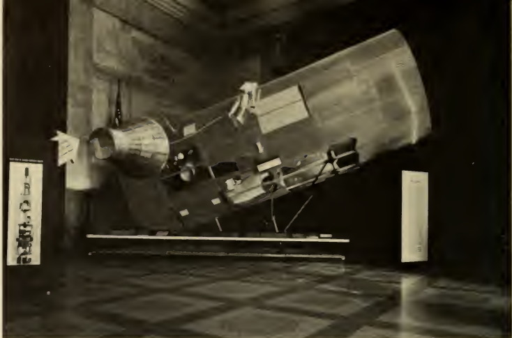
Temporary exhibit, MAN IN SPACE, Theodore Roosevelt Memorial