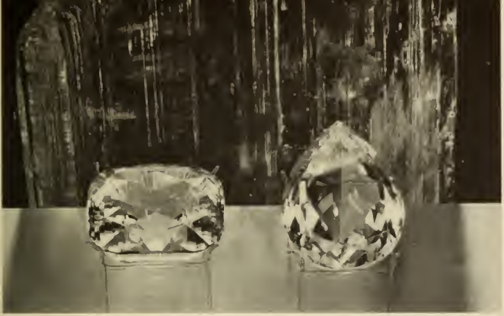
Kunzite crystal and gems, Hall of Minerals and Gems

hall contain a selection of fine carved jades from the William Boyce Thompson collection.