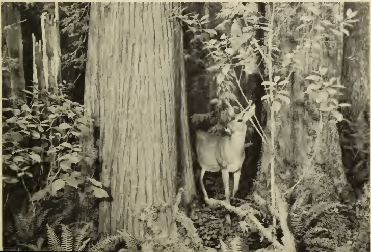
Olympic Forest scene, Hall of North American Forests

Forests are the most widespread natural vegetation on the North American continent, and the most valuable. In this hall, the forest is analyzed as a natural community composed not only of trees, but of a large variety of other plants and animals. Eleven habitat groups depict the variety of forest communities from Arizona to central Canada. Other exhibits explain the structure and internal functions of the forest, the interrelationships between the forest and its environment, the diversity and distribution of forest types, and man's use of the forest and his efforts to protect it.