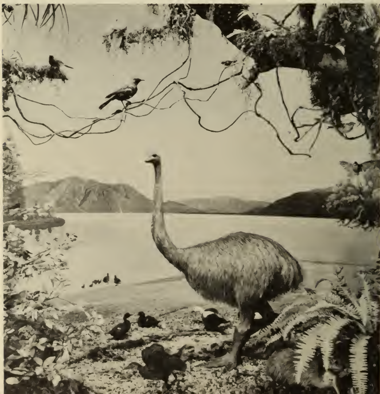
Moa habitat group, Hall of Oceanic Birds

This hall is designed to give the visitor the illusion that he is situated in the middle of the Pacific, as scenes of island bird life from all parts of the great ocean pass before his eyes. Suspended overhead in the sky are oceanic birds in flight. Around the perimeter of the hall, twenty large groups show the birds that inhabit the islands of the Pacific Ocean, from those of the Bering Sea, in the north, to those of Hawaii, Fiji, New Zealand, and beyond. Most of these ex-