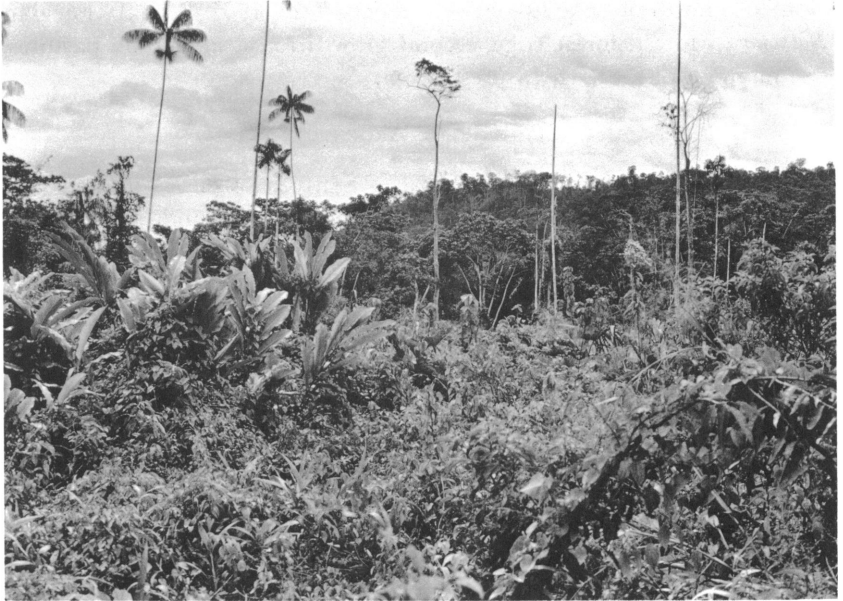
FIG. 2. Small marsh at edge of second-growth subtropical moist forest north-east of Tingo María, Department of Huanuco, Peru (locality 18, see text). Trees in marsh were visited by: Melanerpes cruentatus (nesting in marsh), Colaptes punctigula (nesting in marsh), Dryocopus lineatus , and Campephilus melanoleucos . This marsh is type locality of newly described blackbird Agelaius xanthophthalmus (Short, 1969).