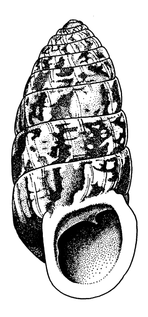
Fig. 1. A specimen of Cerion eximium lerneri , new subspecies, from the type locality.

Types: Holotype, Museum of Comparative Zoölogy No. 186830 from the southern tip of East Bimini, Bimini Islands, Bahamas. Paratypes from the same locality in the Museum of Comparative Zoölogy, the United States National Museum, the American Museum of Natural History, the Academy of Natural Sciences of Philadelphia, and the Museo Poey, Universidad de Habana, Cuba.