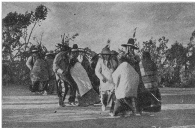
Fig. 5. Ute Bear Dance at Navaho Springs, Colorado.

announces the rite. The men stand in silence on one side of the inclosure, the women sit mutely on the other. Then a bunch of corn-husks for cigarettes, together with a bottle of tobacco, are handed to the leader of the musicians. He takes the husks and tobacco in his hand, reverently bows his head and repeats an incantation, and then rolls a cigarette, passing the husks and tobacco to another singer, who does the same. When each of the singers has rolled a cigarette, all heads are bowed again, there is a long moment of absolute silence, and then the words of an incantation are repeated in chorus by all the singers. It is believed that the words of the incantation are heard in the sky, and that the shades there know that messages are to be sent to them from some of their mortal brothers. After this incantation the cigarettes are lighted and a few puffs blown toward the sky, it being believed that the smoke ascends and provides a smoke of friendship with the shades. Then the particular messages are