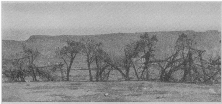
Fig. 1. Ute Bear Dance Enclosure at Navaho Springs, Colorado.