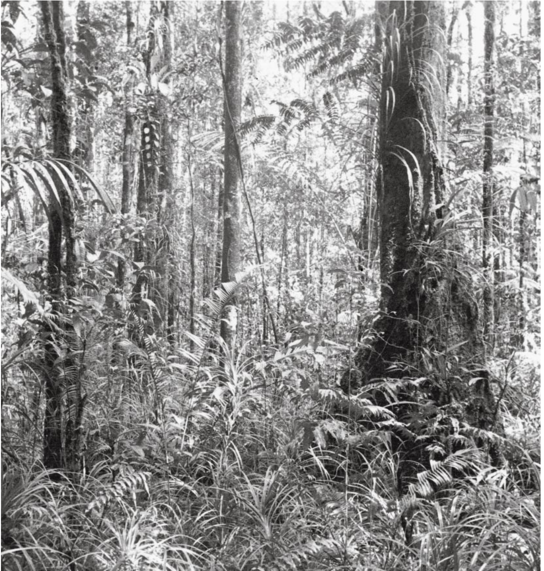
Fig. 7. Lowland rainforest, Fly River, 5 mi below Palmer Junction (locality 61). Photographed during the Third Archbold New Guinea Expedition, 1936–1937.

as the basis for inclusion of the species in Strigoscus have proved unreliable, being for the most part either age related, homoplastic, or just poorly defined (Springer et al., 1990; Norris, 1992). Despite its original placement within P. orientalis sensu lato, there is little in the way of morphological evidence to link P. mimicus to either P. or-