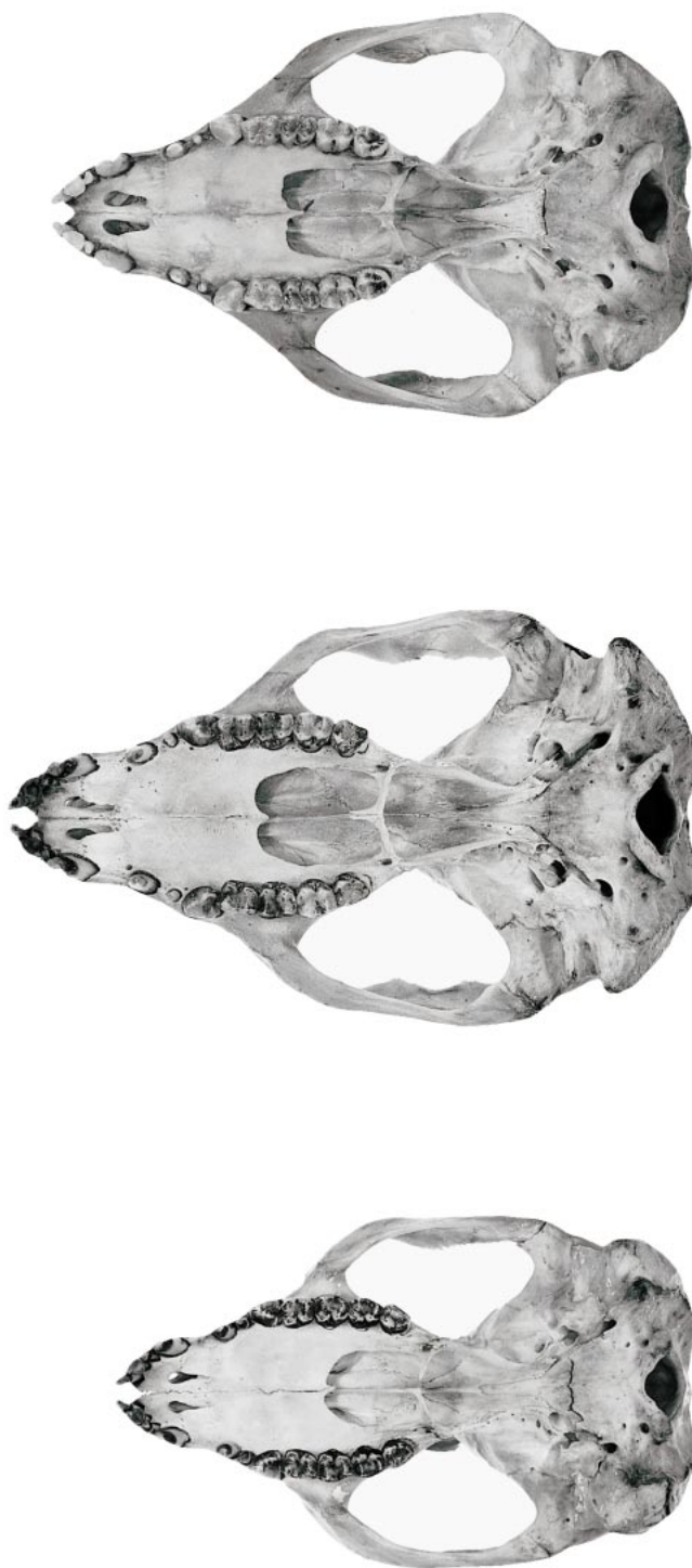
Fig. 3. Ventral views of crania of (a) AMNH 104400, P. minicus ; (b) AMNH 108569, P. intercastellanus ; (c) AMNH 109435, P. orientalis . Natural size.