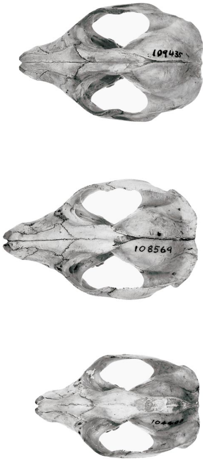
Fig. 4. Dorsal views of crania of (a) AMNH 104400, P. minimus ; (b) AMNH 108569, P. intercastellanus ; (c) AMNH 109435, P. orientalis . Natural size.