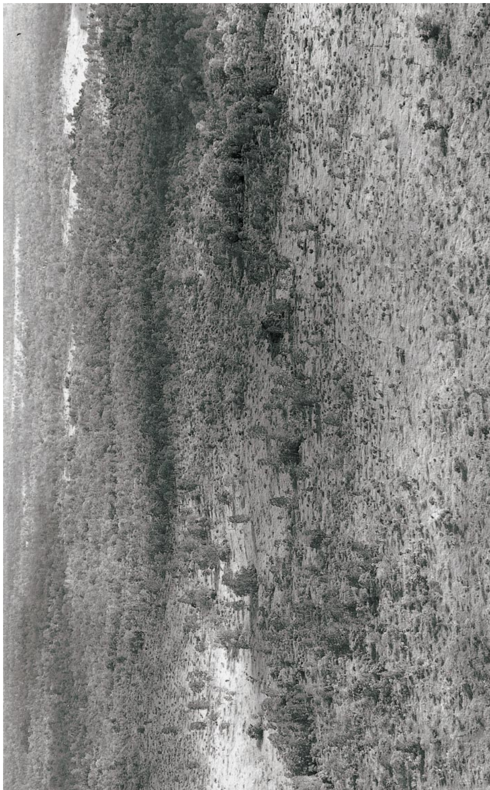
Fig. 6. Aerial view of the Oriomo River area (locality 60), photographed during the Third Archbold New Guinea Expedition, 1936–1937. In the foreground is savanna, with patchy woodlands of Melaleuca and Eucalyptus . Lowland rainforest is concentrated in a band along the line of the Oriomo River, which can be seen running from left to right in the top part of the photograph.