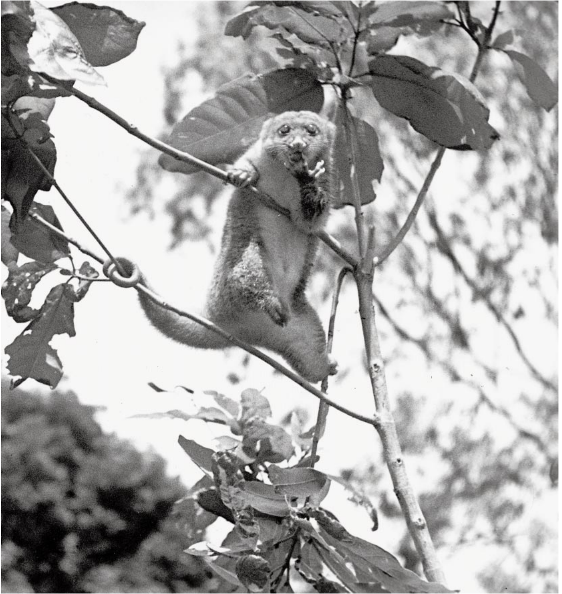
Fig. 2. Captive specimen of a female Phalanger mimicus . Third Archbold New Guinea Expedition, 1936–1937. Gaima, Western Province, Papua New Guinea.

Well-developed postparacrista on M1, with a pronounced buccal kink. Distinguished from P. orientalis and P. intercastellanus by its smaller size, lack of convergence of zygomatic arches rostrally, and by well-developed postparacrista. Distinguished from P. orientalis by absence of white tail tip in females. Distinguished from P. intercastellanus by