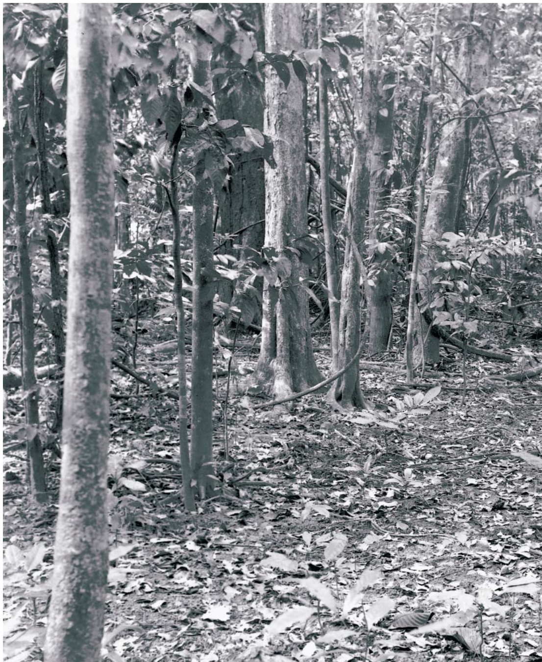
Fig. 8. Rainforest, Iron Range, Cape York Peninsula (locality 57). Photographed during the 1948 Archbold Cape York Expedition.