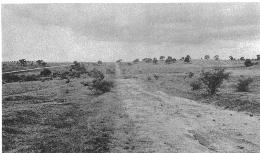
FIG. 4. Habitat of Cicindela rugatilis , aeneicollis , luteolineata , and rufiventris reducens . Jalisco: Highway to Ameca, 2 miles west of junction.

NEW DISTRIBUTIONAL RECORDS: Aguascalientes : El Rentono, 10 miles