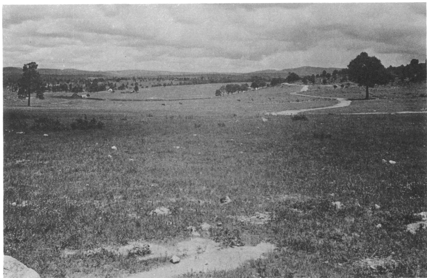
FIG. 5. Habitat of Cicindela nigrilabris, semicircularis . Durango: Eighteen miles east of El Salto.

NEW DISTRIBUTIONAL RECORDS: Zacatecas : Ojo Caliente, June 28,