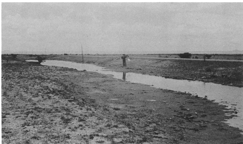
FIG. 3. Habitat of Cicindela rugatilis , nigrocoerulea nigrocoerulea , aeneicollis , punctulata catharinae , sedecimpunctata sedecimpunctata , semicircularis , and aterrima . Aguascalientes: El Retono, 10 miles east of Aguascalientes.

The author (1954) recorded that specimens from Chihuahua and Durango were generally larger than those from the area around Distrito Federal. Series of specimens collected in the intervening area, Zacatecas, Aguascalientes, San Luis Potosi, Jalisco, and Guanajuato, include both large and small individuals in about equal proportions, and it would appear that there is a gradual size increase from south to