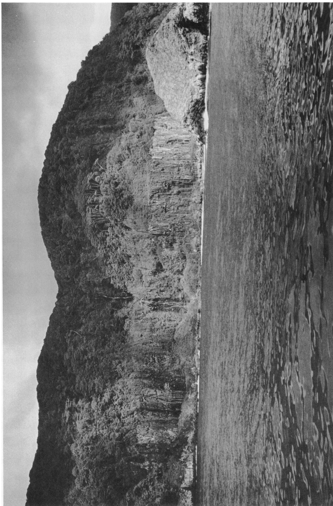
Typical view of shore line