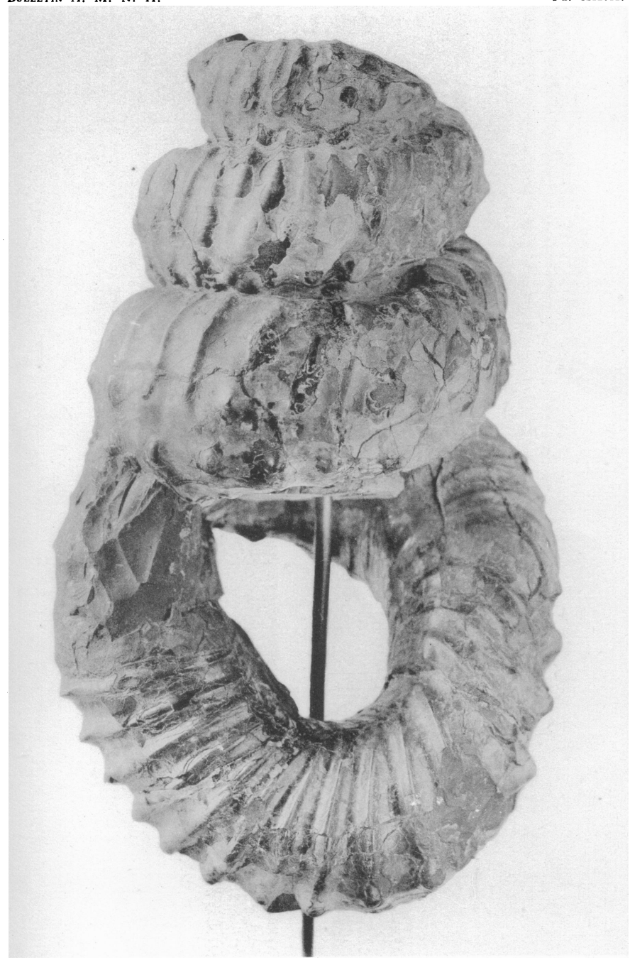
THE FEDERAL ALBERTYPE CO., NEW YORK