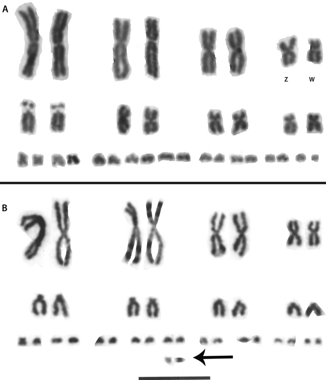
FIGURE 2. A. Karyotype of Oxybelis aeneus ( 2n = 34 , with 16 macrochromosomes and 18 microchromosomes), AMNH R-107584, female, with heteromorphic sex chromosomes, Z and W. B. Karyotype of Xenopeltis unicolor ( 2n = 36 , with 16 macrochromosomes and 20 microchromosomes), AMNH R-104370, male, representing an ancient karyotype of Serpentes (reproduced, reformatted, from Cole and Dowling, 1970). Scale bar = 10 \mu\text{m} .

ner, 1959; Bianchi et al., 1969; Baker et al., 1971, 1972; Gorman, 1973). As that suggestion decades ago was based on fewer species examined and some sketchy karyotype descriptions, we review that hypothesis here.