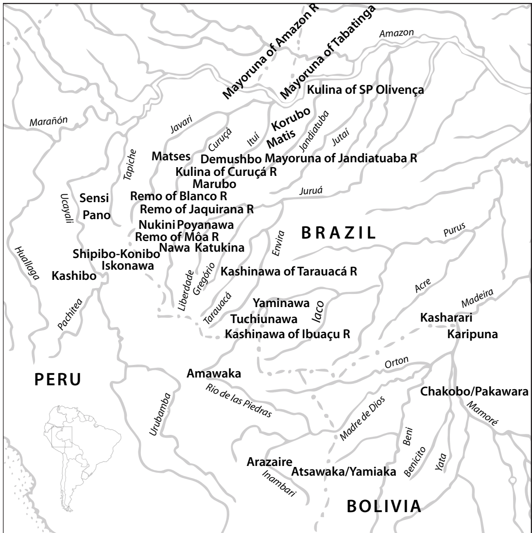
Map 1. Locations of Panoan languages. The first letter of the name is positioned at the location where extant languages are spoken, where extinct languages were spoken, or where languages of captives were spoken prior to their capture. In those cases where languages are spoken over a large or disparate territory, particularly where multiple ethnic groups speak dialects of a single language, the first letter of the name indicates roughly the center of the area over which the language is spoken. See appendix 3 for the precise locations of dialects.