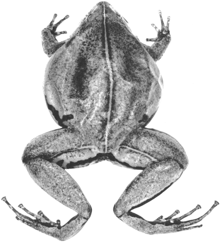
FIG. 1. Dorsal aspect of type specimen of Xenobatrachus obesus , A.M.N.H. No. 64247, natural size.

37.0; head width, 26.0; length of orbit, 4.3; horizontal diameter of tympanum, 3.4; length of snout (anterior corner of eye to tip of snout), 8.3; internarial distance, 5.4; distance from eye to naris, 5.0.