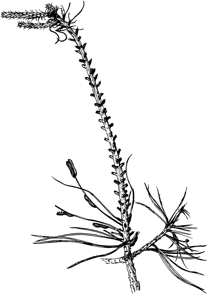
FIG. 1. Sawfly larvae ( Neodiprion nanulus ) feeding on the leaves of a pitch pine.