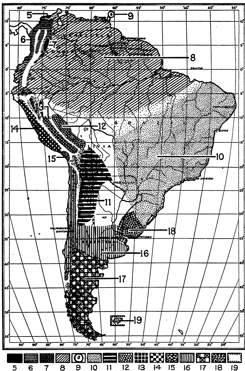
Fig. 2. 5, Troglodytes m. atopus ; 6, T. m. striatulus ; 7, T. m. columbæ ; 8, T. m. albicans ; 9, T. m. tobagensis ; 10, T. m. musculus ; 11, T. m. rex ; 12, T. m. carabayæ ; 13, T. m. puna ; 14, T. m. audax ; 15, T. m. tecellatus ; 16, T. m. chilensis and, from the valley of Copiapo northward, T. m. atacamensis . 17, T. m. magellanicus ; 18, T. m. bonariæ ; 19, T. cobbi .