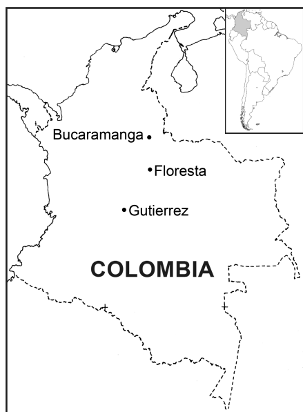
FIG. 1. Map of South America, showing Colombia and the cities of Gutierrez, Floresta, and Bucaramanga.

gested that there was limited faunal exchange between Colombia and the Malvinokaffric Realm, based on the occurrence of calmoniids in the Floresta Formation.