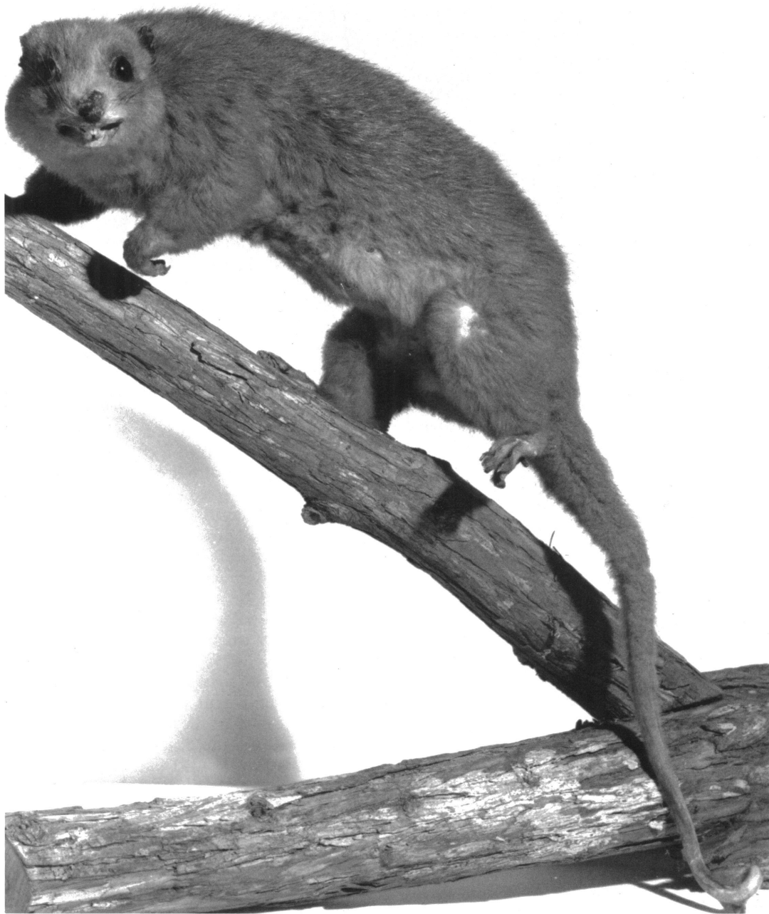
Fig. 1. Pseudocheirus schlegelii , AMNH 864.

bescent mantle over the dorsal distal third, a pattern similar to that found in the holotype, as described by Husson (1964).