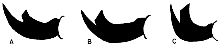
FIG. 3. General types of tarsal claw on the hind tarsi in some Diplotaxis . A. D. mima and profunda . B. D. rockefelleri , indigena , and impar (the last-named has the claws more or less intermediate between A and B). C. D. ennea , decima , convexilabrum , barbarae , rosae , fissilis , glabrimargo , and catarinas .

The size in the paratype series ranges from 9 to 11.5 mm. All but three or four individuals are quite dark in color in contrast to most Mexican parvicollis which are light brown. Of the 112 specimens from Palos Colorados only one has punctures on the scutellum, but of the 13 from Salaces, 11 have one or more punctures.