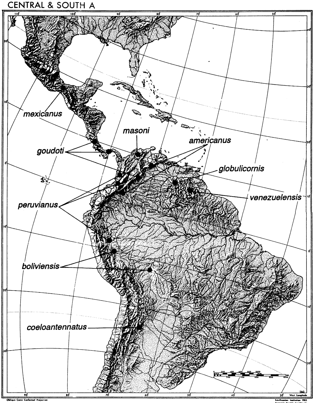
Fig. 1. Distributions of American species of Trochoideus .

posterior two-thirds. Anterior femora of males without tooth on inferoanterior border. Elytra without parasutural stria; apices conjointly rounded.