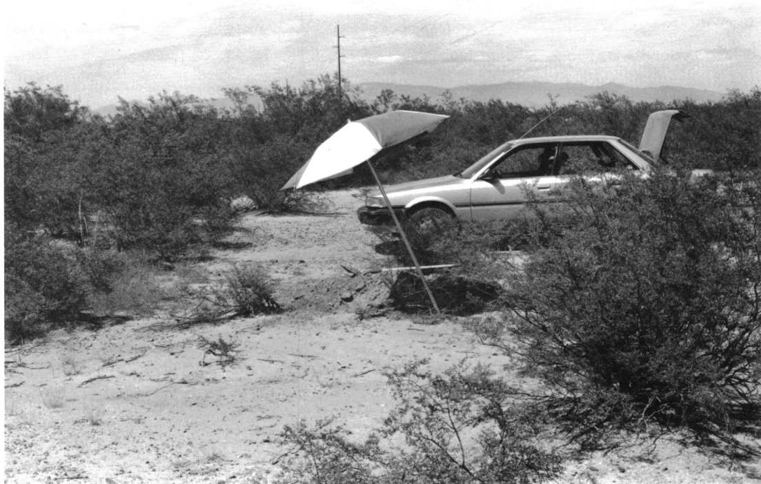
Fig. 1. Nesting site of Idiomelissodes duplocincta at 5 mi east Sahuarita, Pima County, AZ.

subgenus of Svastra . More recently Michener and McGinley (in prep.) considered it related either to Svastra or Melissodes .