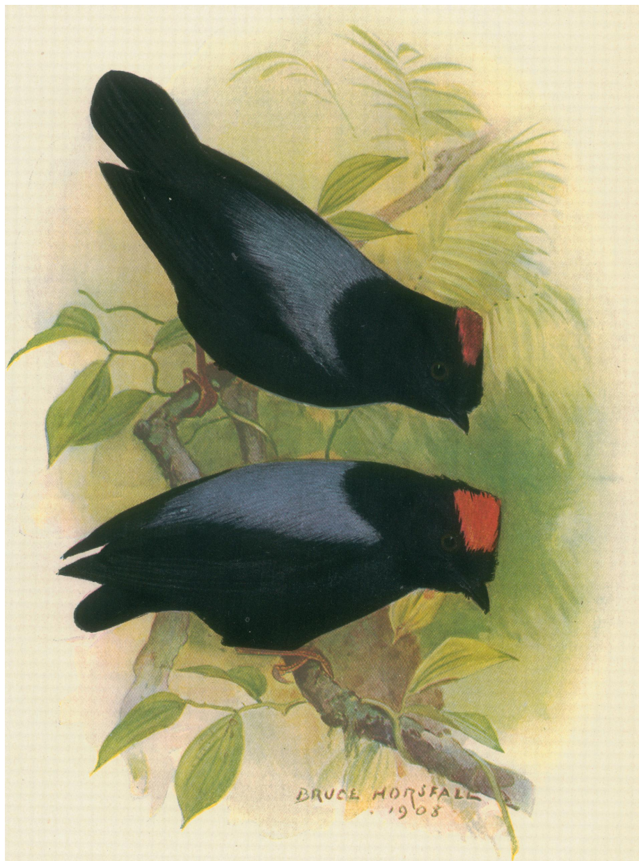
CHIROXIPHIA BOLIVIANA. CHIROXIPHIA NAPENSIS.