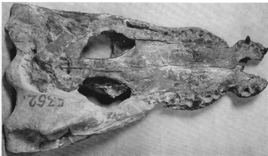
Fig. 2. Leidyosuchus gilmorei , new species. Type, skull, Amer. Mus. No. 5352. Inferior view one-half natural size.