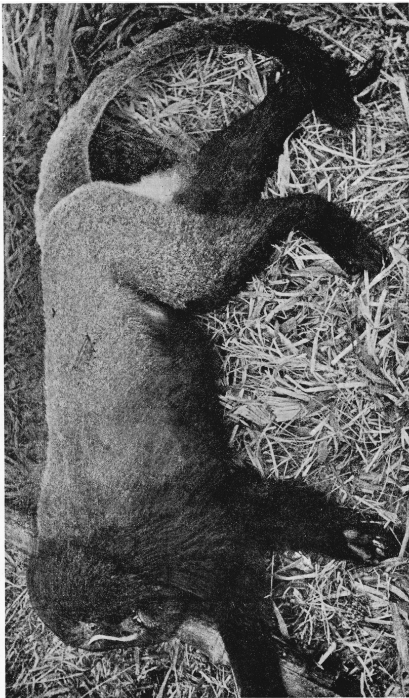
Fig. 1. Cercopithecus hamlyni (AMNH 90028), Mt. Kahusi.