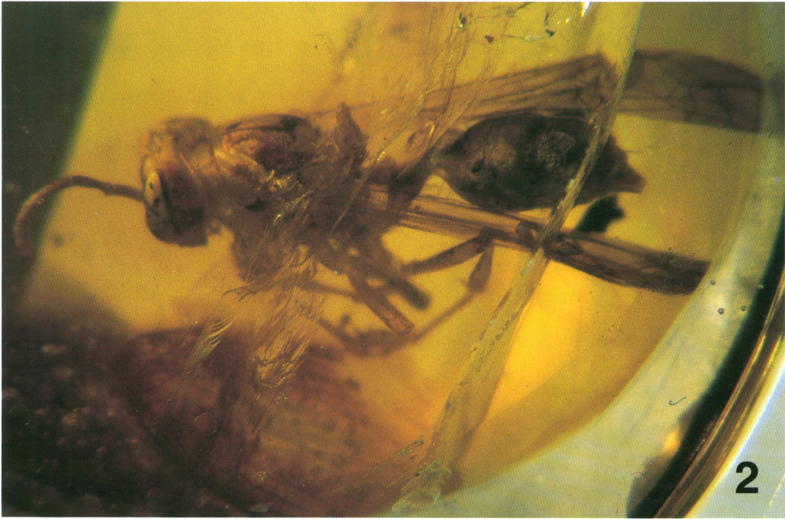
Figs. 1–2. Habitus photographs of Agelaia electra , n. sp. 1. AMNH DR-SH-3: paratype. 2. AMNH DR-14-1040, holotype.