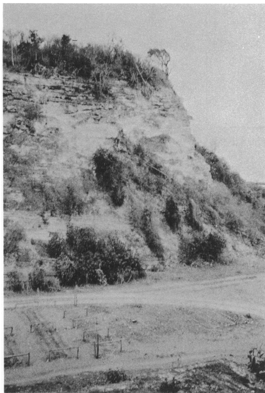
FIG. 2. Bluff on the north side of the entrance of Arroyo Hondo from which Pliocene megafossils were collected.

abundant, the previously mentioned species of hermatypic coral, a brachiopod, and abundant Foraminifera occur in these strata. The general character of the sediment and the enclosed fossils, as mentioned by Jordan and Hertlein, indicates that they were deposited in warm, shallow water, in part perhaps in the littoral zone.