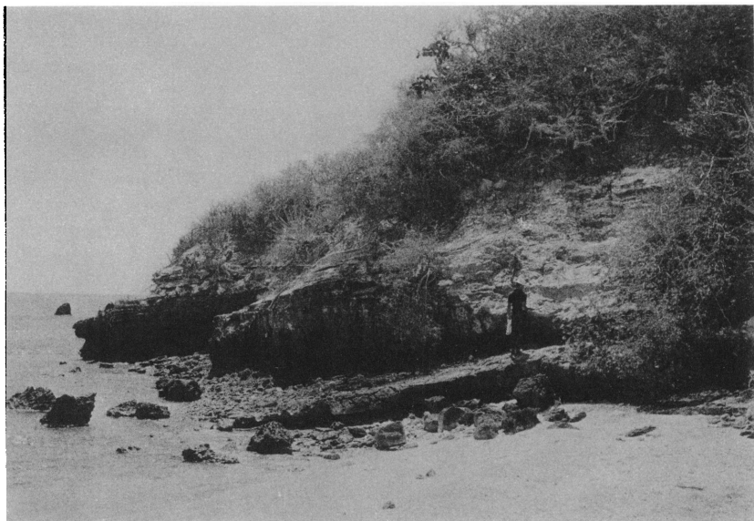
FIG. 3. South headlands of the "cove" on the east side of María Cleofas Island, Pliocene locality F-14.

The number of species in these collections is only six (one identified only as to genus), but the pectens with two exceptions also occur on