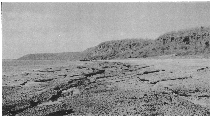
FIG. 5. Terrace deposits on the southeastern end of María Madre Island, near the "salt works," from which Pleistocene megafossils were collected.

A total of 27 species, chiefly mollusks, was obtained from deposits on the east side of María Cleofas Island. The species are enumerated in