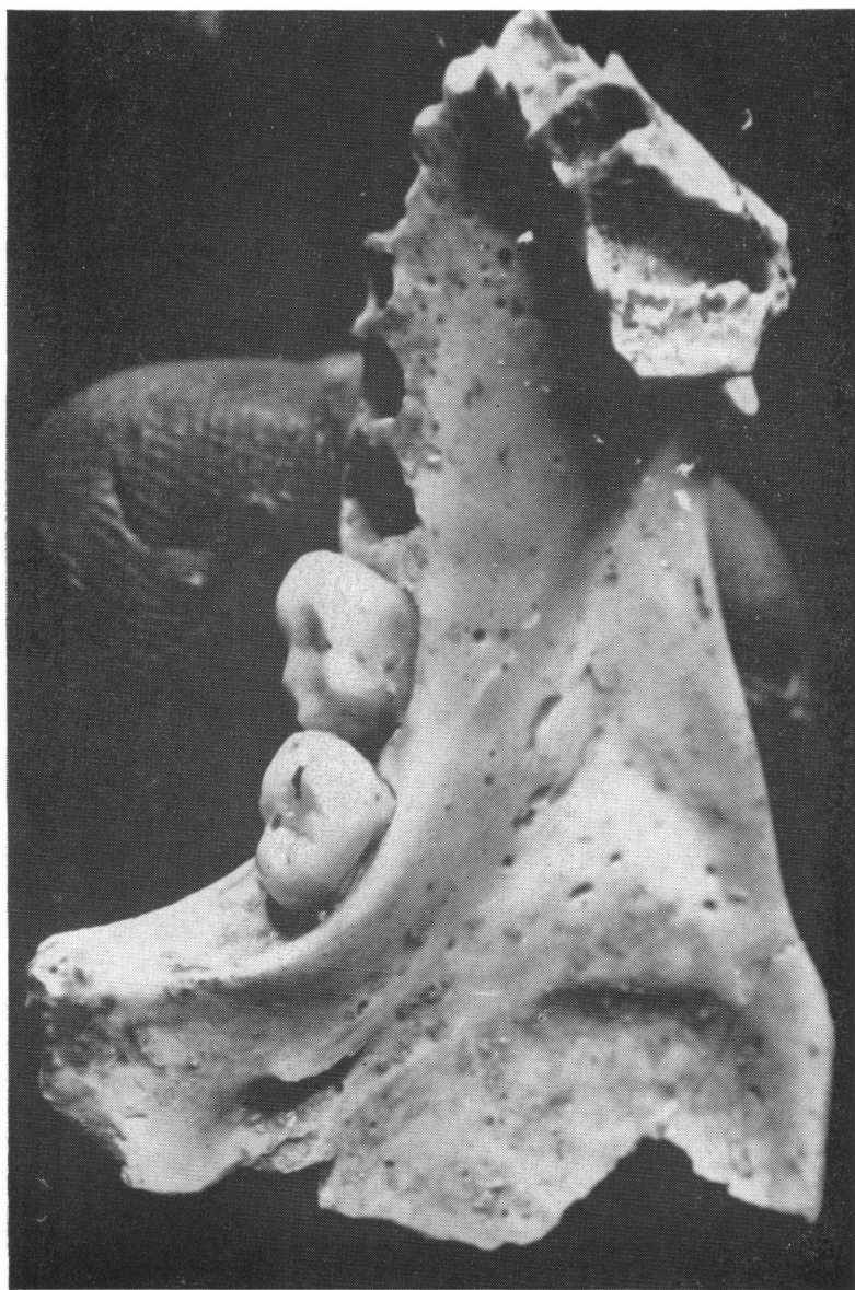
FIG. 2. Xenothrix mcgregori , type mandible, A.M.N.H. No. 148198, internal view. Ca. \times 3\frac{1}{2} .