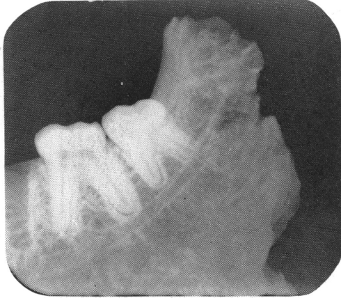
FIG. 4. Xenothrix mcgregori , type mandible, A.M.N.H. No. 148198, X-ray photograph of posterior portion. Ca. \times 2 .

The molars are quite large relative to the jaw, though the jaw itself is robust. Such relatively large teeth are in living cebids characteristic of Alouatta or Brachyteles and are in strong con-