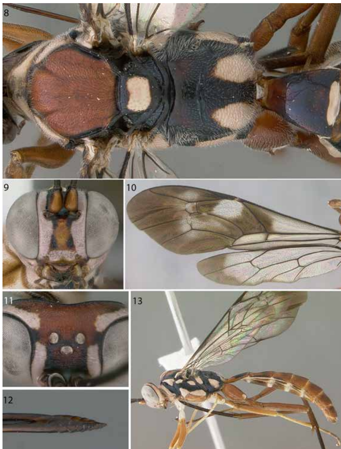
FIGURES 8–13. Nesolinoceras luzbrillante , sp. nov., holotype. 8, Dorsal view. 9, Head in frontal view. 10, Wings. 11, Supraantennal area and vertex, dorsal view. 12, Ovipositor, lateral view. 13, Male paratype habitus.