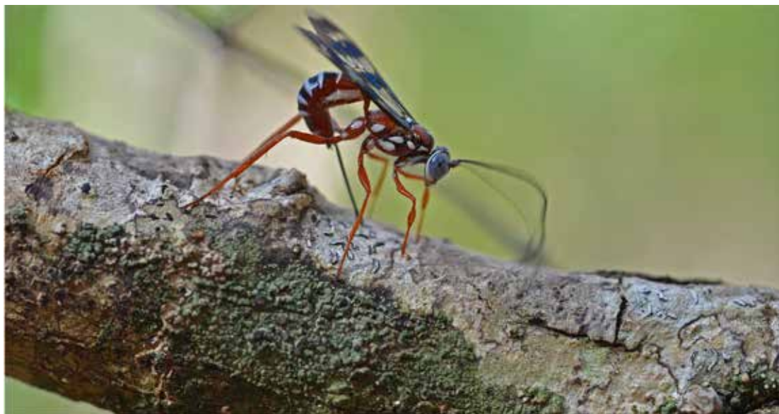
FIGURE 1. Nesolinoceras ornatipennis . A female drilling a tree branch in Varahicacos Ecological Reserve, Cuba.