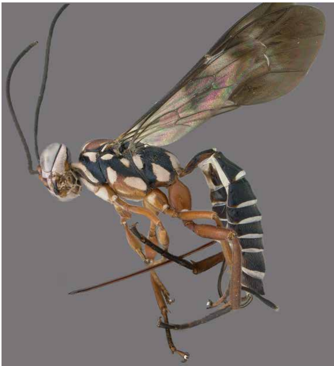
FIGURE 7. Nesolinoceras luzbrillante , sp. nov., holotype habitus.

by black spot at level of lateral ocelli. Median 0.3 of mandible, apical spot on clypeus, supraclypeal and supraantennal areas centrally, scape ventral face, vertex, part of dorsal portion of temple and ventral 0.3 of occiput, ferruginous (168,120,083). Apical 0.3 of mandible, scape dorsal face, pedicel, flagellum, narrow longitudinal lines on supraclypeal and supraantennal area and dorsal 0.7 of occiput, black, the flagellum brownish toward apex. Palpi fuscous (081,076,073). Pronotum black, its dorsal margin and collar whitish; propleuron whitish; mesoscutum brownish (144,103,089), with narrow whitish dashes over anterior portion of notaulus