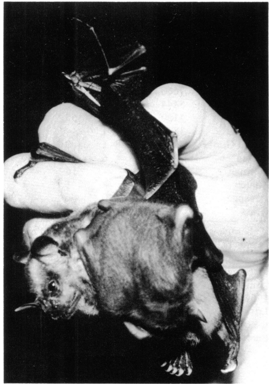
FIG. 2. Adult female Artibeus j. jamaicensis , forearm 62 mm, mist-netted in flight carrying her nursing young, forearm 46 mm, on Guana Island, March 8, 1984.

Six species of bats are known from the Virgin Islands (Koopman, 1975). The only island known to support all six is St. John; this, the third largest of the Virgin Islands, is ca. 5180 ha, of which ca. 60 percent is within Virgin Islands National Park. All three of the bats of Guana are present on St. John. A third phyllostomid, Stenoderma rufum , is a "rare fruit-eating" species (Koopman, 1975); it may be ecologically restricted to the higher, wetter islands, as Koopman suggested, but all records from the Virgin Islands are from near sea level. The second molossid, Tadarida brasiliensis , is known from a single specimen from St. John (Koopman, 1975); this seems inexplicable in view of its penchant for adapting to edificarian habitats and a vast geo-