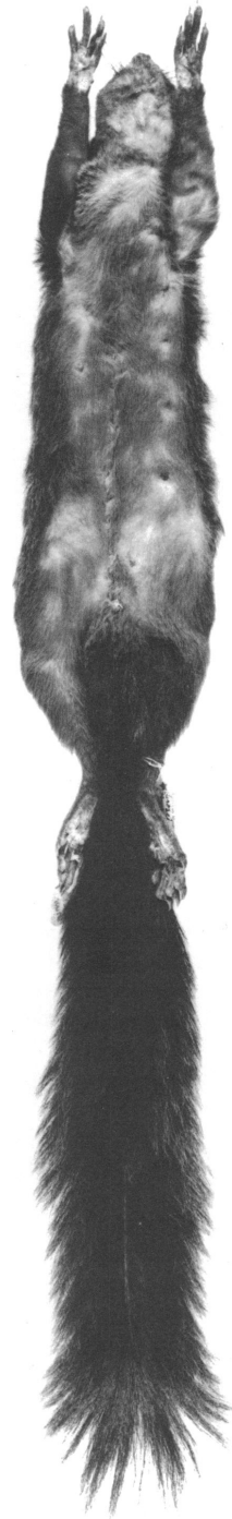
Fig. 1. Sciurus duida , ventral view of study skin.

In a confidential letter to Frank Chapman