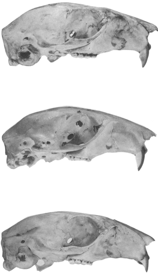
Fig. 3. Crania of South American giant squirrels. Left lateral view. Top: AMNH 77359, Sciurus igniventris from Savana Grande, Venezuela. Center: AMNH 36153. Bottom: AMNH 93035, Sciurus spadiceus from Villa Bella Imperatriz, Amazonas, Brazil. Natural size.

S. igniventris and was of the opinion that only pelage color separated S. duida from S. igniventris . He made no comment about the skull characters Allen had mentioned or about Allen's footnote. When Goodwin compiled his catalog, he followed Tate and listed S. duida as a subspecies of S. igniventris (Goodwin, 1953).