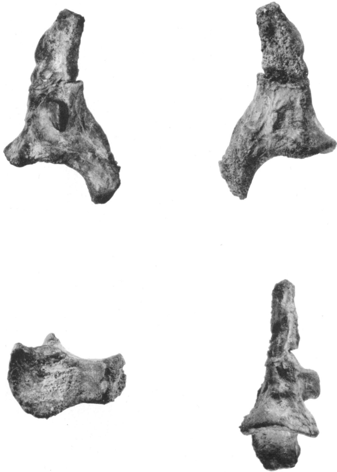
FIG. 1. Unretouched photographs of the fragmentary right scapulocoracoid of Djadochtatherium matthewi (A.M.N.H. No. 20440), a late Cretaceous multituberculate from Djadochta , Outer Mongolia. Upper left : "Lateral" view. Upper right : "Medial" view. Lower left : Glenoid fossa. Lower right : "Posterior" view. All \times 4 .

specimens from the same locality. It has recently become possible to remove some of this matrix and thus to permit certain additional observations. Simpson stated that the relationship of glenoid cavity to blade is exactly that of higher mammals and fundamentally unlike that in monotremes. In addition to Simpson's comments, to which the reader is referred, it may be noted that, if the coracoid projected pos-