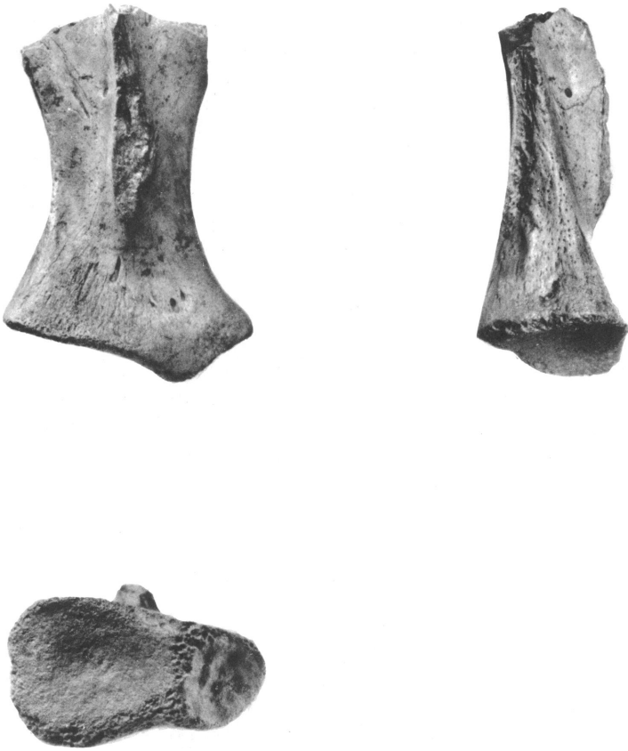
FIG. 4. Unretouched photographs of Y.P.M. No. 11769, type of Camptomus amplius Marsh, 1889, fragmentary right therian scapula with facet for the coracoid, Hatcher's quarry no. 1, Lance formation, late Cretaceous, Lance Creek, Wyoming. Upper left : "Lateral" view. Upper right : "Posterior" view. Lower left : Glenoid fossa and coracoid facet. All \times 4 .

The coracoid is clearly a separate ossification in Y.P.M. No. 11769 and A.M.N.H. No. 55991, however, a fact that must be accounted for. Although almost no fully adult therian mammals living at the present time possess a large, separately ossified coracoid bone, the coracoid does persist as such a structure until very late in ontogeny in at least some individuals of a number of therian types and has actually been found in adults of a few living genera. Parker (1868, p. 204, pl. 23, fig. 21) figured and briefly mentioned a shoulder blade of an adult Myrme-