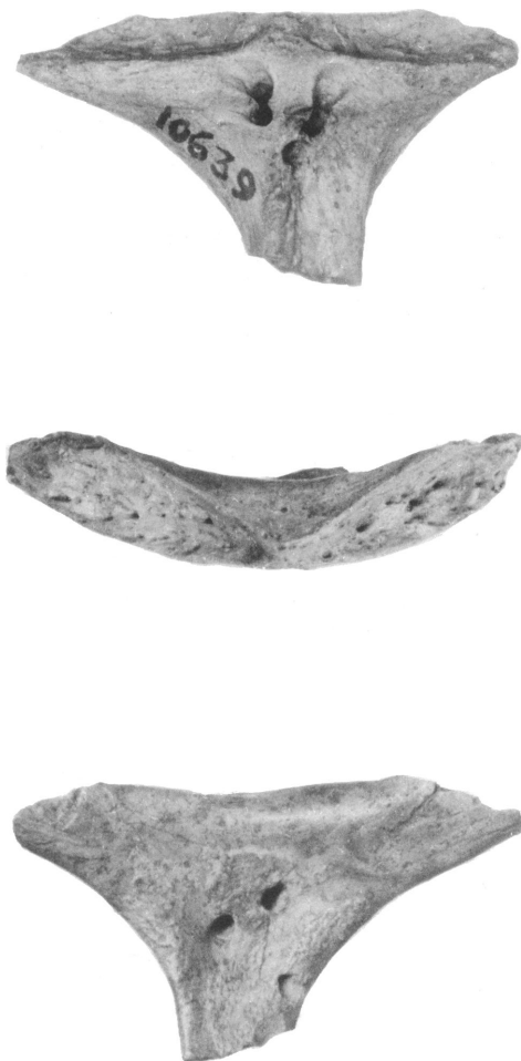
FIG. 5. Unretouched photographs of a possible allotherian interclavicle (Y.P.M. No. 10639), probably from Hatcher's locality no. 1 (?U.C.M.P. locality V-5711), Lance formation, late Cretaceous, Lance Creek, Wyoming. Above : Ventral view. Center : Anterior view. Below : Dorsal view. All \times 4 .

and that the lateral wings at its anterior end bear elongate facets for the reception of a pair of bones, presumably the clavicles. Marsh's identification is probably correct. 1 Among the Lance vertebrates, how-