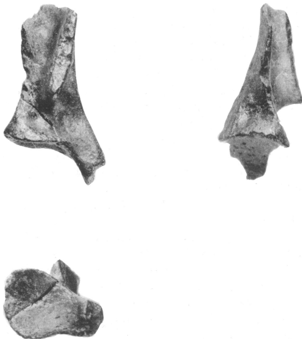
FIG. 2. Retouched photographs of A.M.N.H. No. 58850, a fragmentary right scapulocoracoid of a small multituberculate here designated Lance Type 1, U.C.M.P. locality V-5620, Lance formation, late Cretaceous, Lance Creek, Wyoming. Upper left : "Lateral" view. Upper right : "Posterior" view. Lower left : Glenoid fossa. All \times 8 .

laterad than in Djadochtatherium . As is the scapulocoracoid of the latter genus, the coracoid is firmly fused to the scapula in the adult, but the position of the former suture is not known. The coracoid is broken, so that there is no direct information concerning its length. It is a large and important structure, however, just as it is in Djadochtatherium , and it projected anteroventromediad.