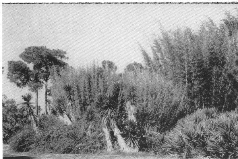
FIG. 4. Introduced yuccas and bamboos supplement the brushy cover along the entrance drive.

Florida, though they may be seen a few miles away. Nevertheless, so great has been the destruction of natural habitat in southern Florida that this Station may prove eventually to be the only large undisturbed tract of pine in that part of the state. Already citrus groves surround it to the south and east, and semi-cleared areas to the west and north. A few wide-ranging birds may have deserted the Station as a result. Among those possibly in this category are the Red-cockaded and the Pileated Woodpeckers.