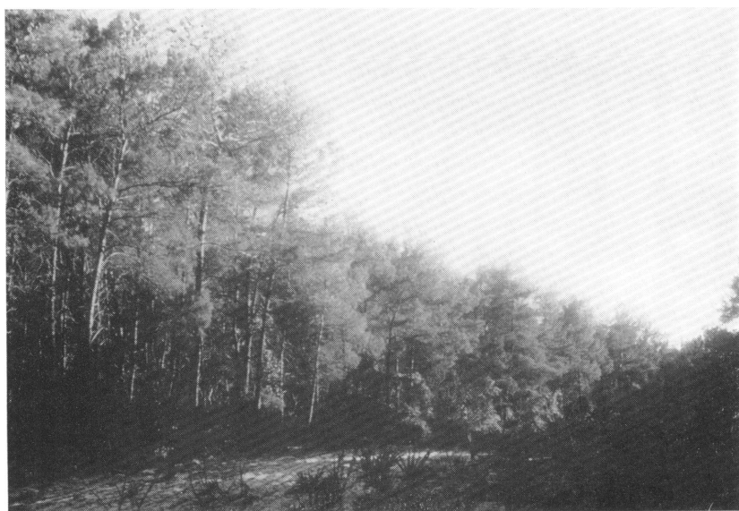
FIG. 2. Stand of sand pine in northeastern part of Station. Fire lane in foreground.

The northwestern part of the Station, as stated above, is the lowest and, although drainage ditches run through it, the understory vegetation is more luxuriant than elsewhere (fig. 3). Several species of shrubs, includ-