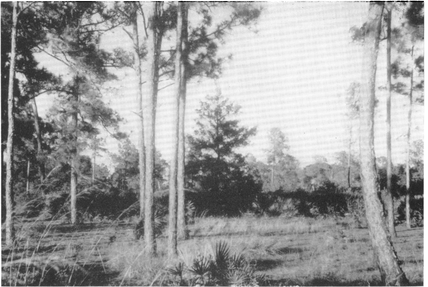
FIG. 1. Occasional grassy openings occur, but usually there is a dense understory of palmettos or scrub oak.

A county road flanked by wide grassy areas runs from north to south through the Station. Approximately one-third of the area lies to the west of this road, including the main laboratory buildings and cottages at the southwest corner. The western part of the property is somewhat lower than the eastern, and at the northwestern corner the elevation falls to about 127 feet above sea level. A cement-lined drainage ditch (see map in Bogert, 1947, p. 3) some 4 or 5 feet deep was constructed the length of the western part of the property, along with side drainage ditches. This ditch contains some running water at all times of the year. It drains into a small lake north of the property. The entire Station is dissected by wide,