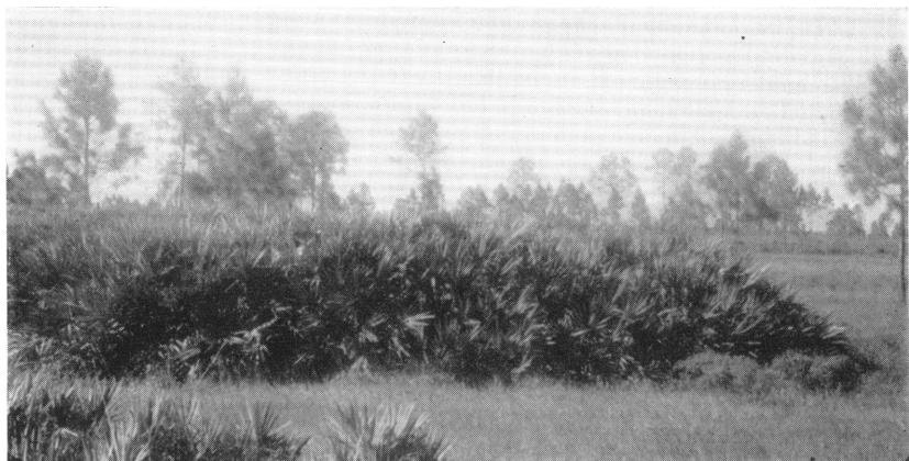
FIG. 5. Clump of palmettos to west of Station, which is used as a roost by Red-winged Blackbirds.