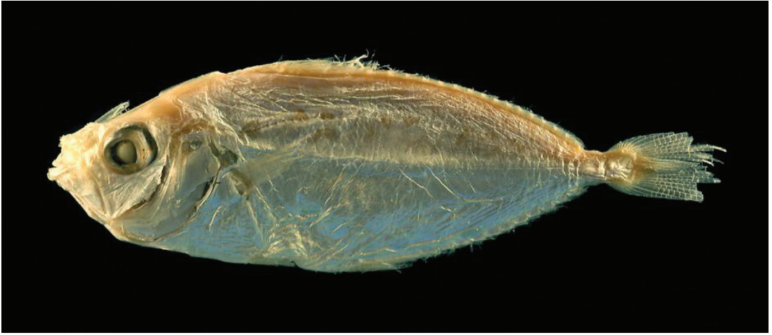
FIG. 4. Equula oblonga , holotype, MNHN A-6754, 61.8 mm SL; Timor, Indonesia.

be identified on the holotype to place the species in Equulites . The holotype of E. oblongus is intact, nondissected, and lacking any evidence of translucent flank patch(es) or a stripe that would allow one to place it in the genus Equulites . Based on overall body shape, including lateral profile of the lower jaw and remaining flank pigmentation pattern above the lateral midline in preservation, we believe the holotype of E. oblongus (MNHN A-6754) should actually be placed in Photolateralis .