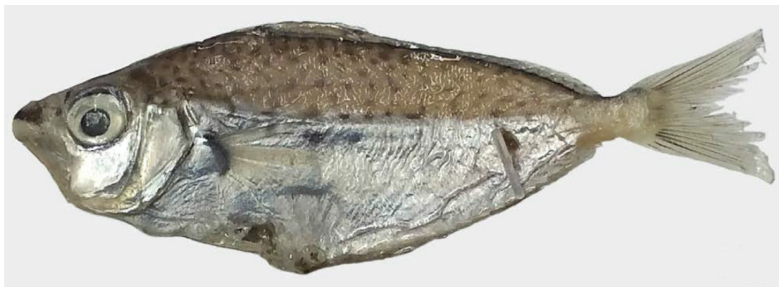
FIG. 1. Photolateralis polyfenestrus , new species, holotype, AMNH 267152, male, 66.8 mm SL; Sultanate of Oman: Gulf of Oman, Mutrah Fish Market. Note: Specimen has field tag on posterior flank and anteriormost midlateral window is obscured behind pectoral-fin rays in image.

melanophores. Stripe located at midflank, beginning about level of terminal adducted pelvic-fin rays. Lips grayish. Lower jaw and gular region grayish. Snout with large black patch above upper lip. Two distinct black blotches present anterior to orbit; dorsal blotch covering anterior portion of postnasal spines on lateral ethmoid. Dorsal and ventral margins of orbit lined in black pigment. Interorbital region and nape grayish anteriorly to grayish-brown posteriorly. Large, oblong dark brown marking posterior to orbit and dorsal to opercle. Chest and belly silvery; silvery along ventral midline. Dorsal and anal fins hyaline to pale yellowish-white, with a slight concentration of black pigment distally on dorsal-fin spines. Base of dorsal fin black; becoming more prominent (i.e., darker) posteriorly. Pectoral and pelvic fins yellowish tan. Caudal peduncle pale tannish yellow with blackish saddle on dorsal margin. Base of caudal fin pale yellow. Caudal fin yellowish to olive proximal to base, becoming translucent to white distally. Membrane of caudal fin with concentration of black pigment, creating series of thin, black radiating lines, particularly near base.