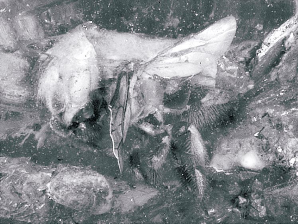
Fig. 1. Photomicrograph of Ctenoplectrella zherikhini n.sp. (holotype female, UA-1748). Specimen length 5.2 mm.

the 16 insect orders and 97 families reported from Rovno amber was provided by Perkovsky et al. (2003, to which can be added the Aleyrodidae and Megachilidae). Although roughly contemporaneous with the more historically studied Baltic amber, the fauna of Rovno amber is quite distinct. More than 26% of the ants represent genera and species not found in Baltic amber (Dlussky and Perkovsky, 2002) and all of the more than 50 species of gall midges are unique to Rovno amber (Fedotova and Perkovsky, 2004, 2005; Perkovsky and Fedotova, 2004). In particular, the Rovno amber fauna differs from that of the Baltic by the dominance of Sciaridae and other forest litter Diptera, whereas Chironomidae and other aquatic insects are underrepresented (Perkovsky et al., in prep.).