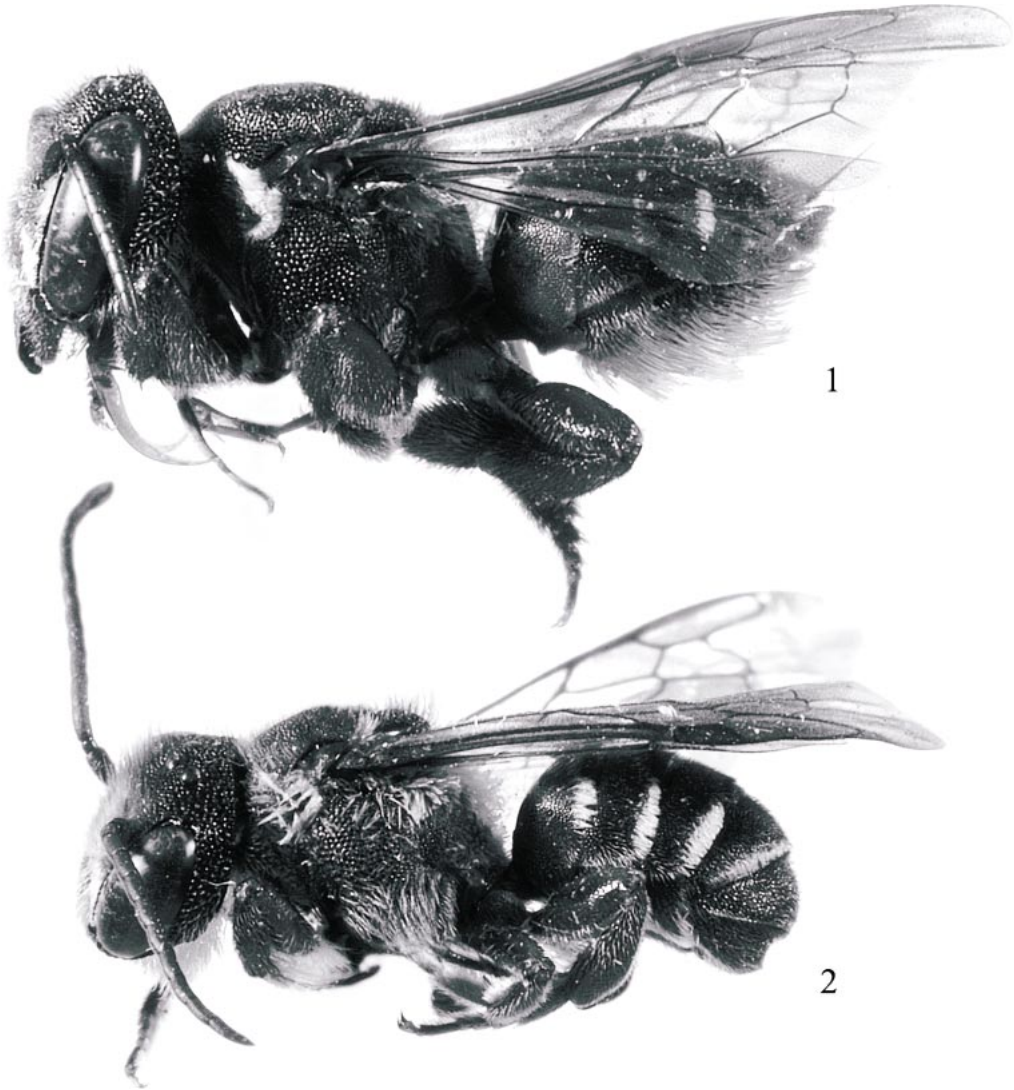
Figs. 1-2. Photomicrographs of Megachile (Matangapis) alticola Cameron. 1. Female, lateral habitus. 2. Male, lateral habitus.

scutellum): width (between tegulae) ratio 1: 0.96. Pretarsal ungues cleft and arolium present on all legs; procoxa unmodified, mutic, anterior surface without cluster of rufescent setae, simply, uniformly pubescent; profemur, protibia, and protarsus unmodified; protarsus slender, with short, even, anterior fringe and longer, irregular posterior fringe; probasitarsus parallel-sided, about three times as long as broad; speculi absent. Mid-legs unmodified, mesotibial calcar present; mesotarsal fringes as described for forelegs.