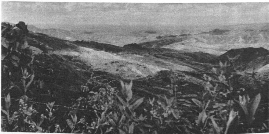
FIG. 2. Eroded hills near Mondomo, Cauca, Colombia. Observed habitat of Cypseloides lemosi .

The other species of Cypseloides differ from C. lemosi in size as well as in color pattern and structure. Cypseloides senex is a large, unicolored form with stiff, not emarginate tail. The very rare C. cherriei is smaller also, with a stiff, not emarginate tail, and with a white spot in front of each orbit. Cypseloides rutilus is smaller, has an emarginate but stiff tail, a rufous chestnut collar and chest in adults, and differs from other Cypse-