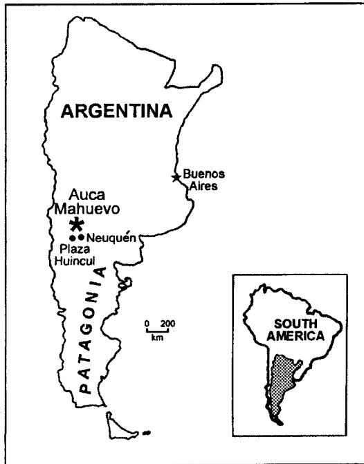
Fig. 1. Index map showing the location of Auca Mahuevo in Neuquén Province, Argentina.

This period constituted the second greatest period of subsidence in the basin's history (Maceda and Figueroa, 1995: fig. 3).