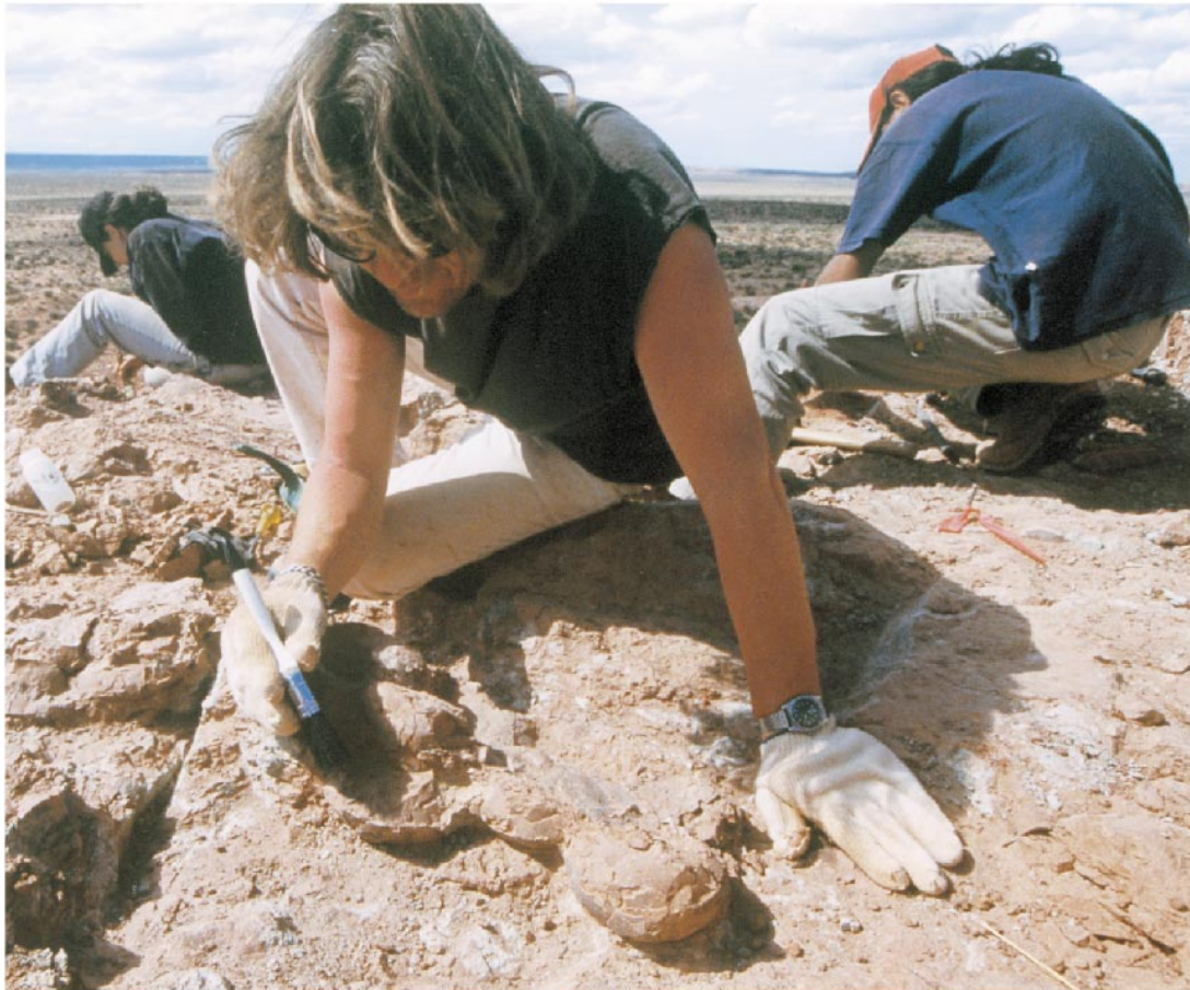
Fig. 5. Collectors excavating cluster of more or less complete sauropod eggs from quarry. Eggs are about 12–15 cm in diameter.

panian. No radioisotopic or paleomagnetic data have previously existed for the Neuquén Group. Age estimates for formations within the Neuquén Group have been based on constraining the age of the group as a whole, using the ages of over- and underlying strata. The Río Colorado Formation has been assigned the youngest age within this range because it is the stratigraphically highest formation in the group.