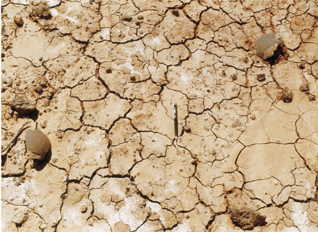
Fig. 4. Fragments of eggs and egg shell weathering out on the flats where the fossiliferous mudstone is exposed. Pencil is about 14 cm long.

ural rate of embryonic mortality. Interestingly, the eggs from this hillside quarry have not yet preserved definitive patches of fossilized skin casts, and the bed containing the eggs is relatively thin, less than 2 m thick.