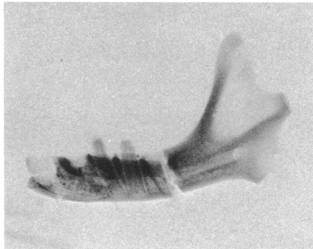
FIG. 2. Tetrapassalus mckennai Simpson. Type, A.M.N.H. No. 56030, incomplete right lower jaw. X-ray photograph (printed as positive). \times 3 .

The first and fourth cheek teeth (as well as the canine) were lost before burial, but the second and third are preserved. The latter two teeth are closely similar, simple, peg-like cylinders. The cross sections